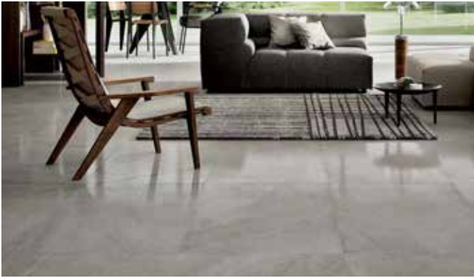
Pietra Italia Grey 24" × 24"