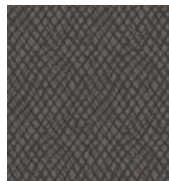
934 London Dust