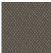
938 Navarino Smoke