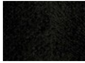
989 Restained Beauty