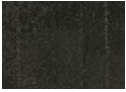
965 Elegantly Smart