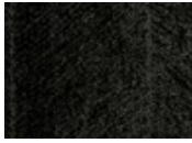
975 Enduring Space