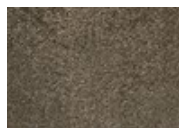
948 Vintage Charm