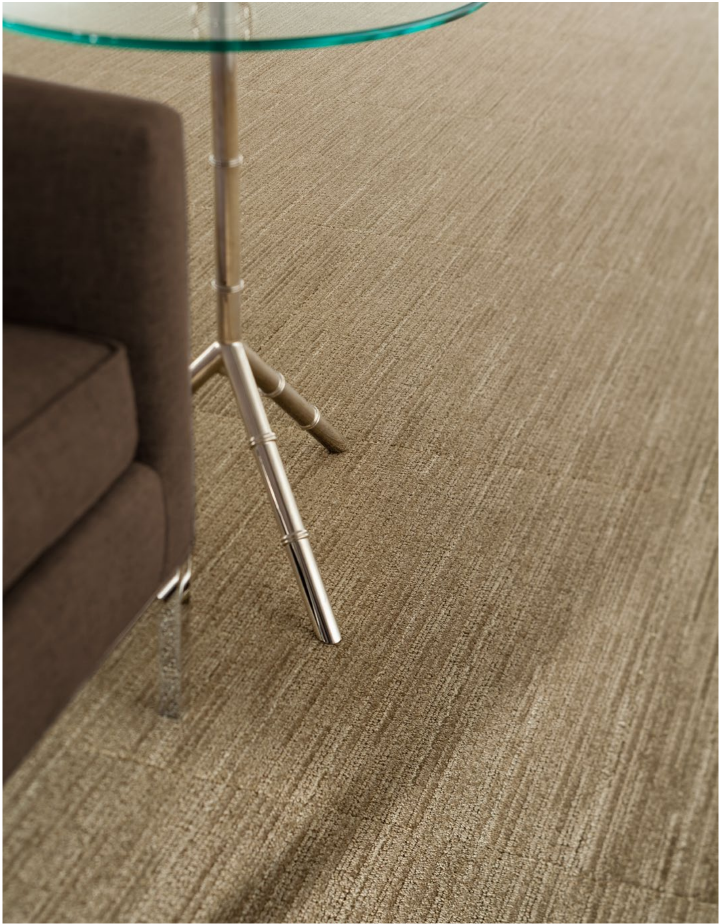
Narrow II in Nambu-Goto, monolithic tile installation