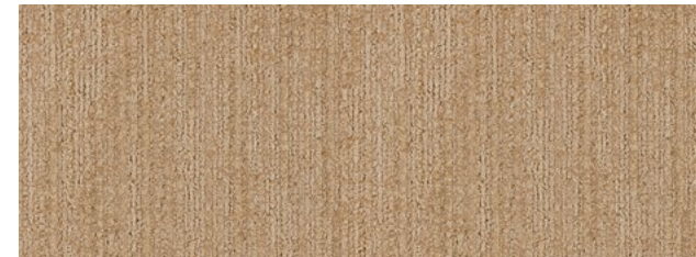
NAR90 CALABI-YAU SPACES (Any Which Way II ANY90, Round & Round II ROU90, Up & Up II UPA90)