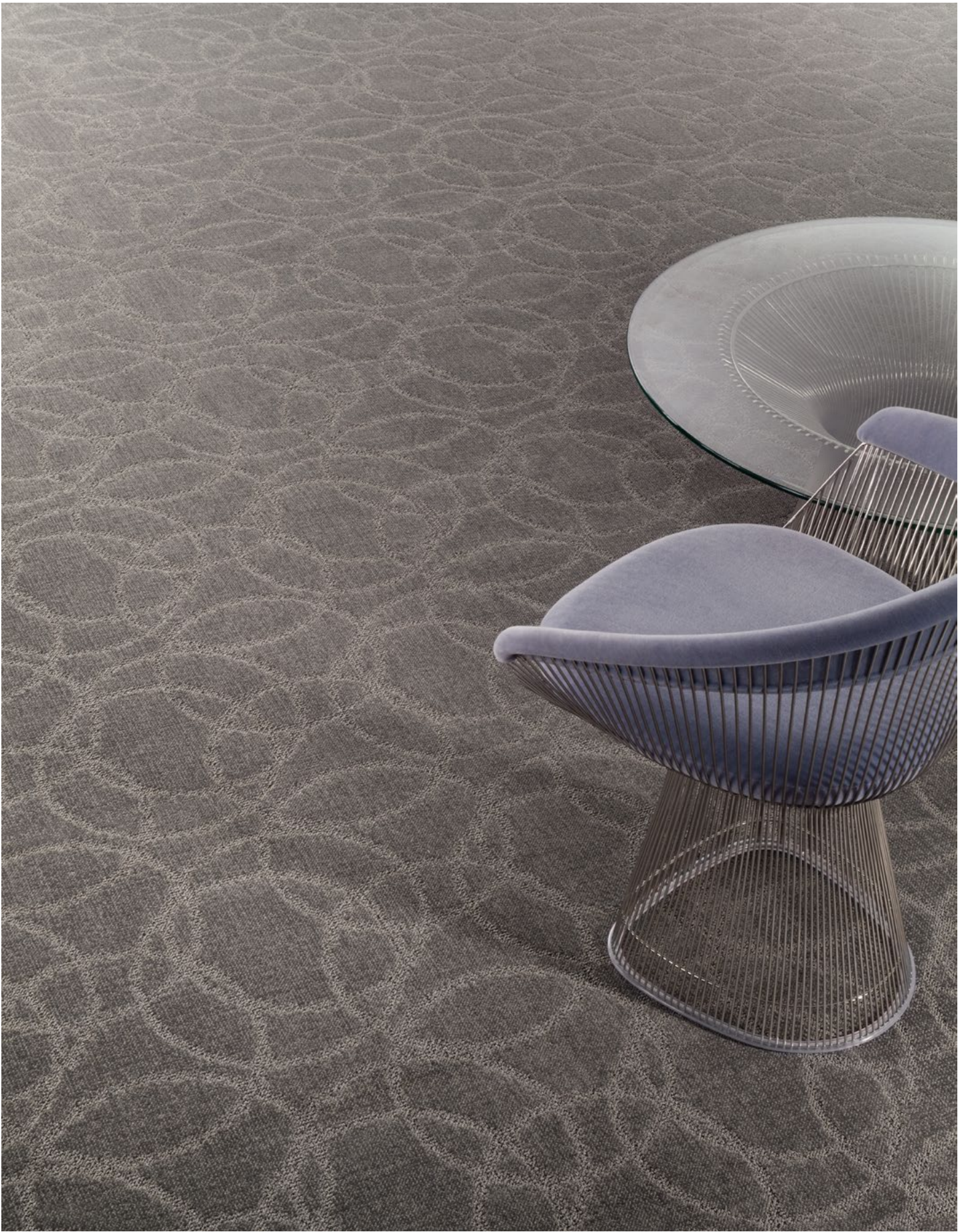
Round & Round II in Bosonic String, broadloom installation