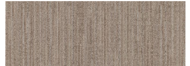
NAR86 PLANCK FORCE (Any Which Way II ANY86, Round & Round II ROU86, Up & Up II UPA86)