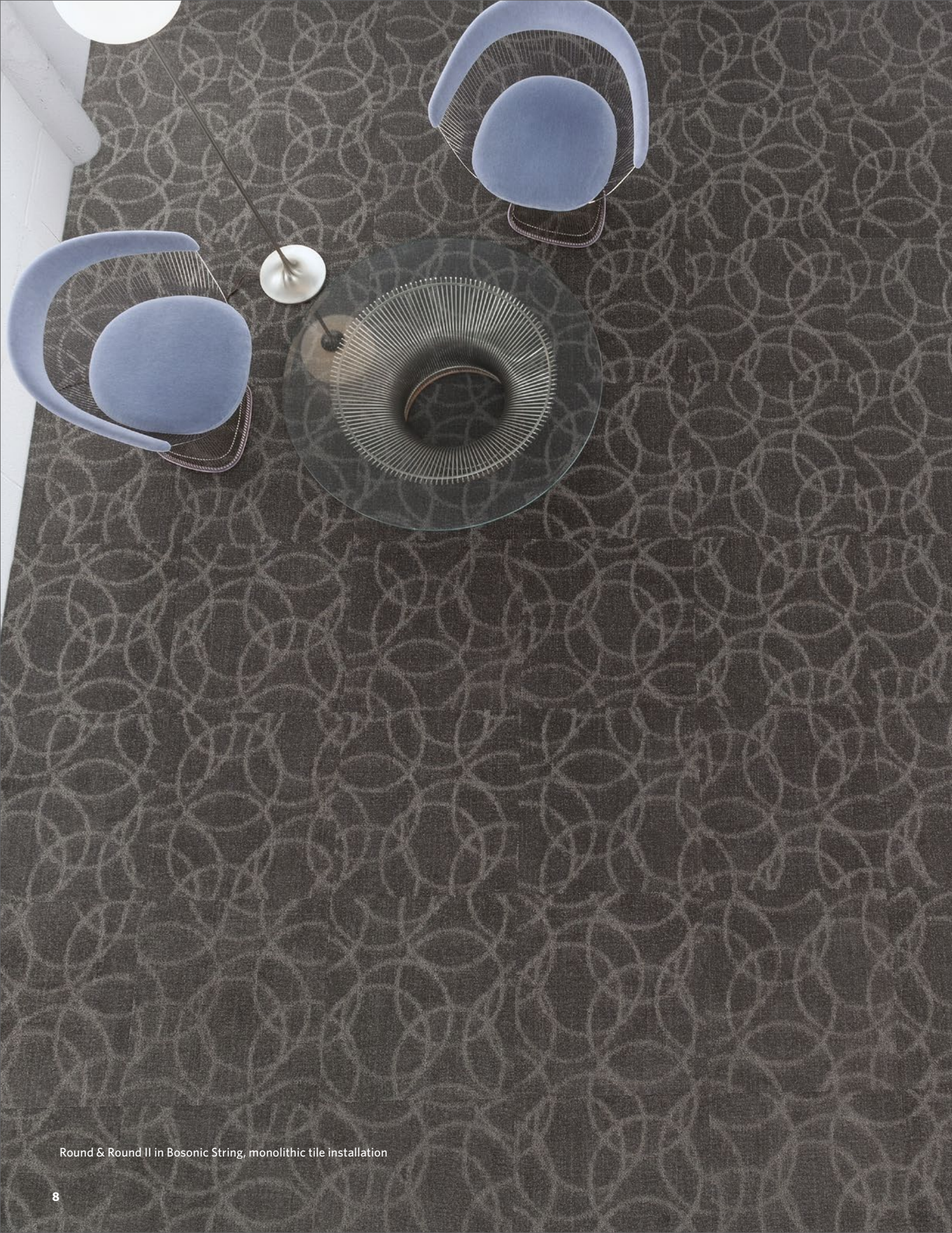
Round & Round II in Bosonic String, monolithic tile installation