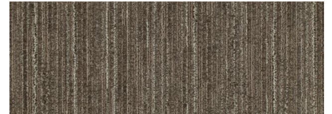
NAR23 YANG-MILLS THEORY (Any Which Way II ANY23, Round & Round II ROU23, Up & Up II UPA23)