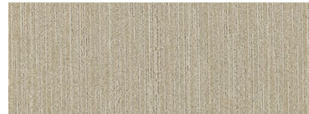
NAR54 SUPERSYMMETRY (Any Which Way II ANY54, Round & Round II ROU54, Up & Up II UPA54)