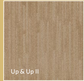
Up & Up II