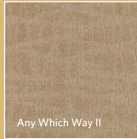
Any Which Way II

Any Which Way II / Narrow II Round & Round II / Up & Up II