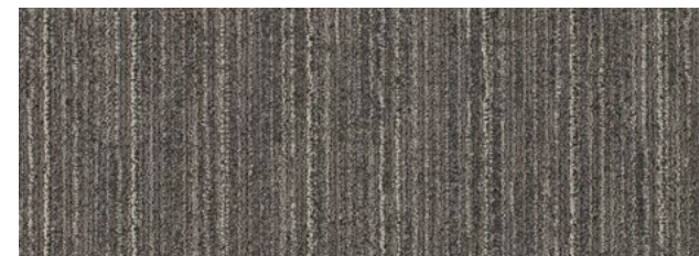
NAR58 ANTI DE SITTER SPACE (Any Which Way II ANY58, Round & Round II ROU58, Up & Up II UPA58)