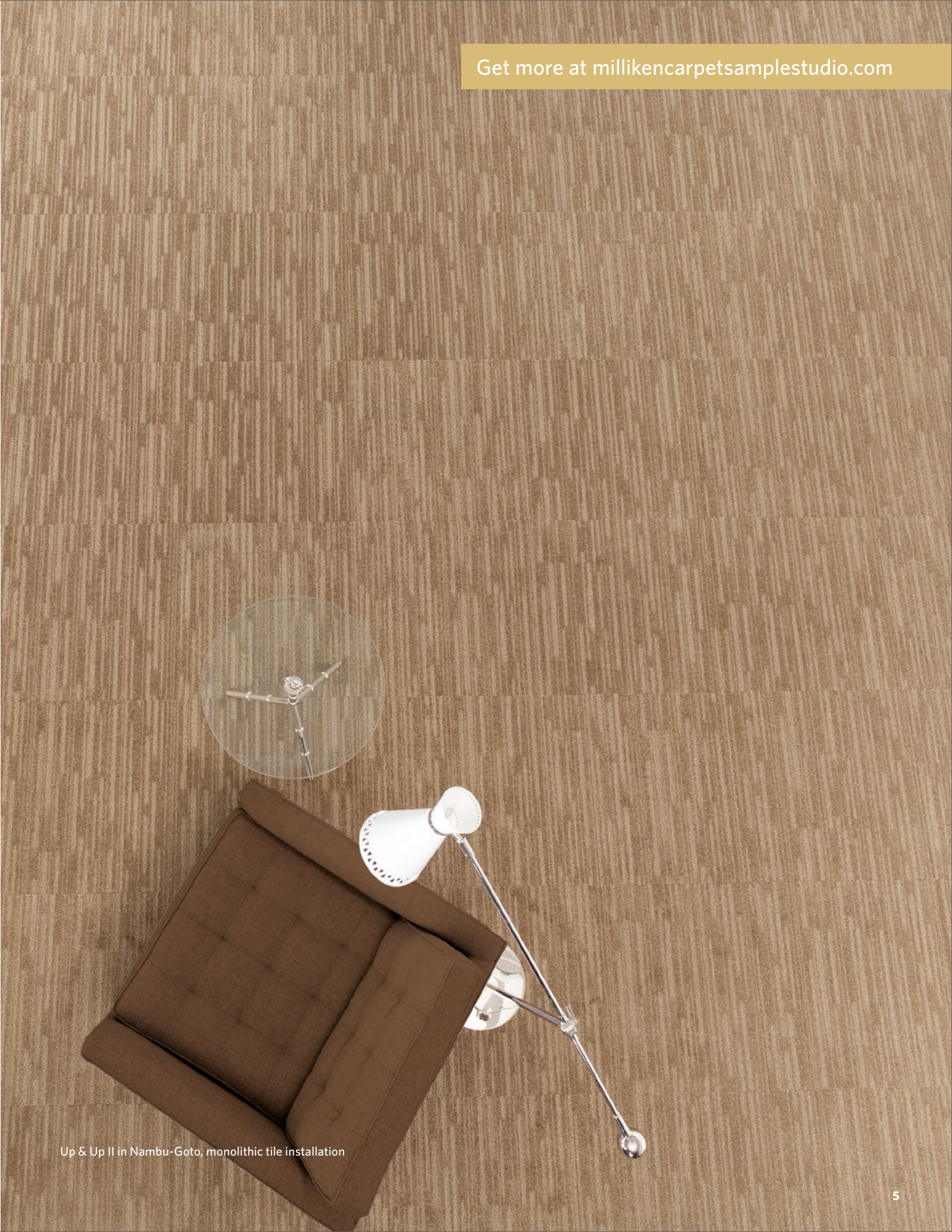
Up & Up II in Nambu-Goto, monolithic tile installation