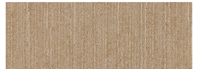
NAR81 NAMBU-GOTO (Any Which Way II ANY81, Round & Round II ROU81, Up & Up II UPA81)