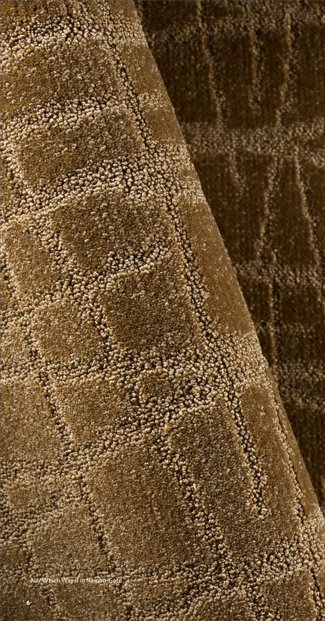
Any Which Way II in Nambu-Goto