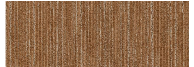
NAR77 SUPERSTRING REVOLUTION (Any Which Way II ANY77, Round & Round II ROU77, Up & Up II UPA77)