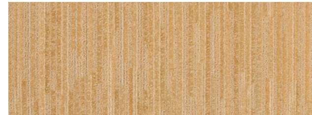
NAR12 POLYAKOV ACTION (Any Which Way II ANY12, Round & Round II ROU12, Up & Up II UPA12)