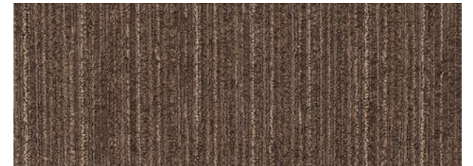
NAR59 EIGENVALUES (Any Which Way II ANY59, Round & Round II ROU59, Up & Up II UPA59)