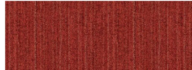
NAR60 BRANEWORLD (Any Which Way II ANY60, Round & Round II ROU60, Up & Up II UPA60)