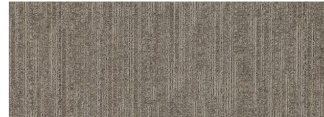
NAR40 BOSONIC STRING (Any Which Way II ANY40, Round & Round II ROU40, Up & Up II UPA40)