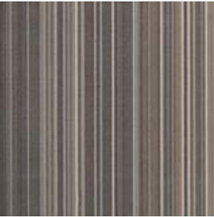
FIXATE FX110 SUMMIT