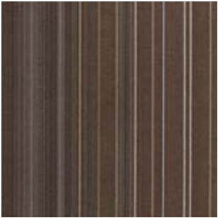
FIXATE FX103 WEATHER