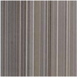
FIXATE FX131 ISOTOPE