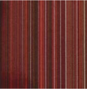
FIXATE FX127 FREQUENCY