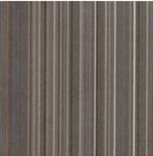
FIXATE FX109 ONLINE