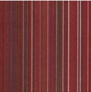
FIXATE FX129 TICK-TOCK