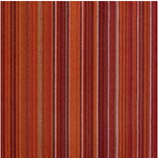
FIXATE FX124 NON-ZERO