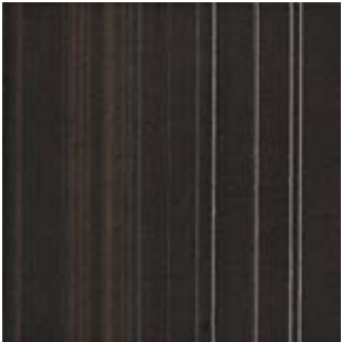
FIXATE FX104 CHOCOLATE