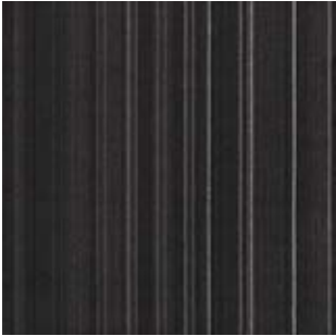
FIXATE FX112 VICTORY