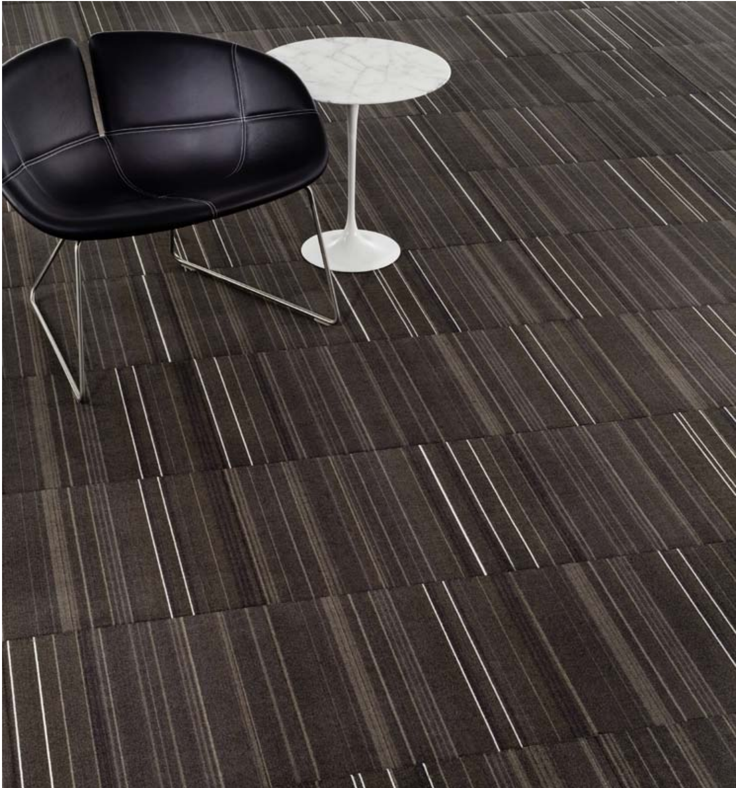
Fixate Velvet in Chocolate, monolithic installation

Available in two modular tile bases, Velvet & Loop, Fixate celebrates the ultimate detail in stripes, exploring precision and varying widths of fine lines. Playful and bold multicolor combinations reside among monochromatics, providing fresh, clear colors and subtle neutrals. The broad palette provides an option for a sophisticated, highly detailed floor that either pops or lies down. The velvet base is a dense, high performing felt-like cut pile that bridges the gap between hard and soft surface and is the perfect canvas for the intricate detail and resolution of this design. The high-performance, loop pile offers an alternative for an everyday performing modular tile.