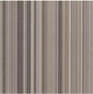
FIXATE FX108 LIGHTNING