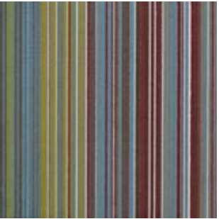
FIXATE FX138 TEMPERATURE