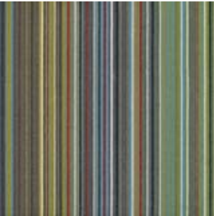
FIXATE FX139 TRANSFORM