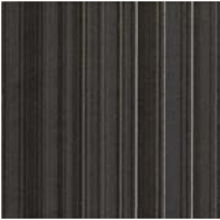
FIXATE FX111 CARBON