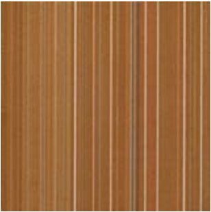
FIXATE FX123 PERFECTION