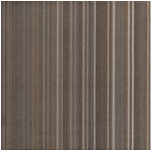
FIXATE FX101 GENETIC DRIFT

Available in two modular tile bases, Velvet & Loop, Fixate celebrates the ultimate detail in stripes, exploring precision and varying widths of fine lines. Playful and bold multicolor combinations reside among monochromatics, providing fresh, clear colors and subtle neutrals. The broad palette provides an option for a sophisticated, highly detailed floor that either pops or lies down. The velvet base is a dense, high performing felt-like cut pile that bridges the gap between hard and soft surface and is the perfect canvas for the intricate detail and resolution of this design. The high-performance, loop pile offers an alternative for an everyday performing modular tile.