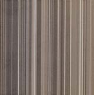
FIXATE FX107 IN-THE-DETAILS