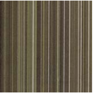
FIXATE FX136 WORLD RECORD