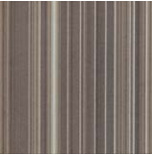
FIXATE FX106 ALCHEMY