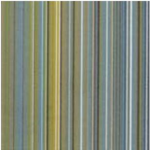
FIXATE FX134 COMPOUND