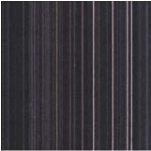
FIXATE FX115 PRIZE