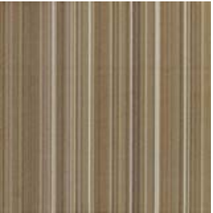
FIXATE FX119 PHOTOSYNTHESIS