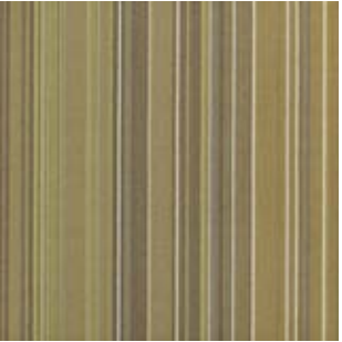
FIXATE FX117 COALESCENT