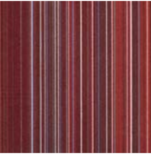
FIXATE FX126 OBSESSION