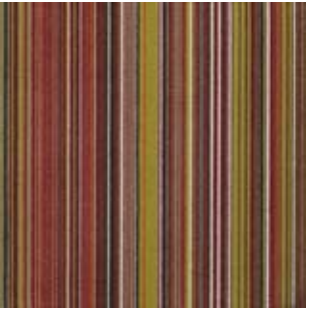
FIXATE FX140 DIPLOID