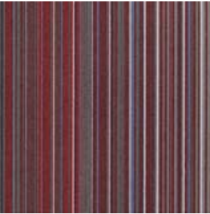
FIXATE FX128 NITROGEN