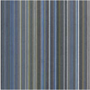
FIXATE FX132 FREUD