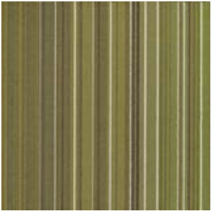
FIXATE FX135 SUGAR