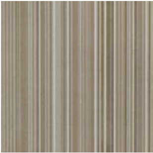
FIXATE FX113 STATUS