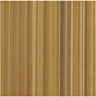
FIXATE FX121 EYE-TRACKING