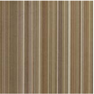
FIXATE FX118 FINITE