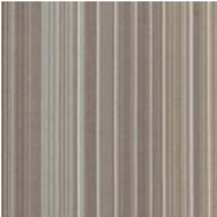
FIXATE FX114 HOLE-IN-ONE