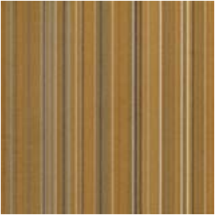
FIXATE FX122 BRASS RING