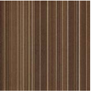
FIXATE FX120 MUSE