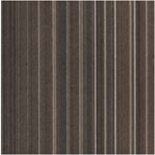
FIXATE FX102 VITAL TWELVE