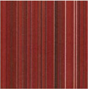
FIXATE FX125 MUTATION