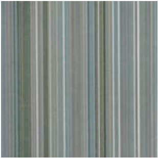
FIXATE FX133 CELEBRITY