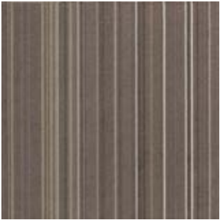
FIXATE FX105 PUNCTUALITY