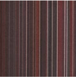
FIXATE FX130 WINNING ENTRY