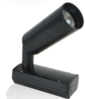
DE-PM2 | Universal Power Module™ 2 (Specify Denali Series™ Fixture Separately)