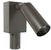
DE-TMB | Tenon Box Mount™ (Specify Denali Series™ Fixture Separately)