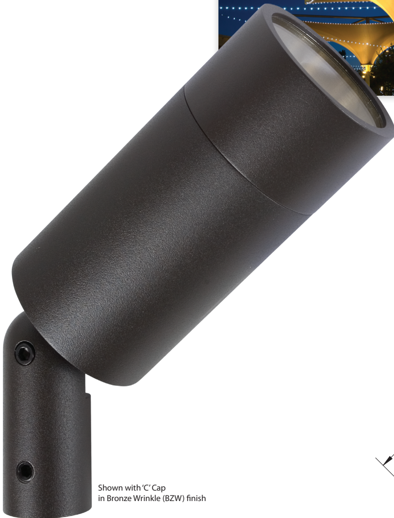
Shown with 'C' Cap in Bronze Wrinkle (BZW) finish