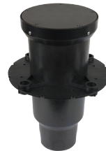
HP2RM | Remote In-Grade (Flush) (Specify Denali Series™ Fixture Separately)