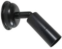
DE-PC | Power Canopy System™ (Specify Denali Series™ Fixture Separately)