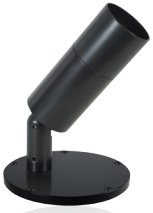
DE-HP2 | In-Grade (Flush) (Specify Denali Series™ Fixture Separately)