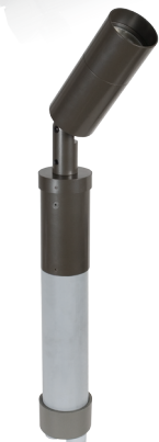
DE-PPII | Power Pipe II™ System (Specify Denali Series™ Fixture Separately)