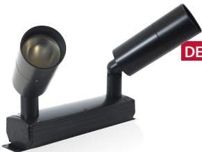
DE-PM2D | Universal Power Module™ 2 Dual (Specify Denali Series™ Fixtures Separately)