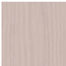
HEMLOCK White Wash