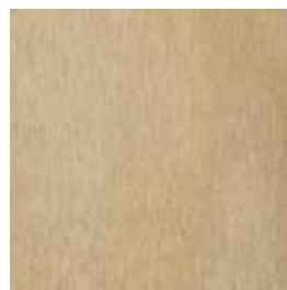
WHITE BIRCH PLYWOOD Clear