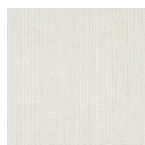
102 Drift 2