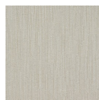
113 Reflect 2