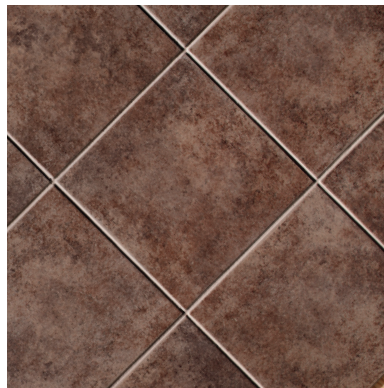
AV115 ▶ Rushmore