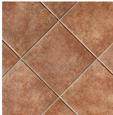
AV113 ▶ Alamo