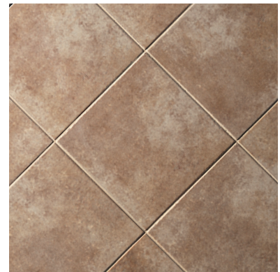
AV114 ▶ Grand Canyon