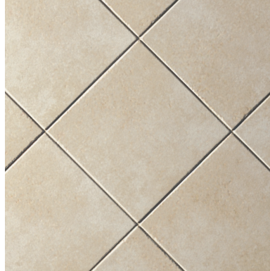
AV111 ▶ Monticello