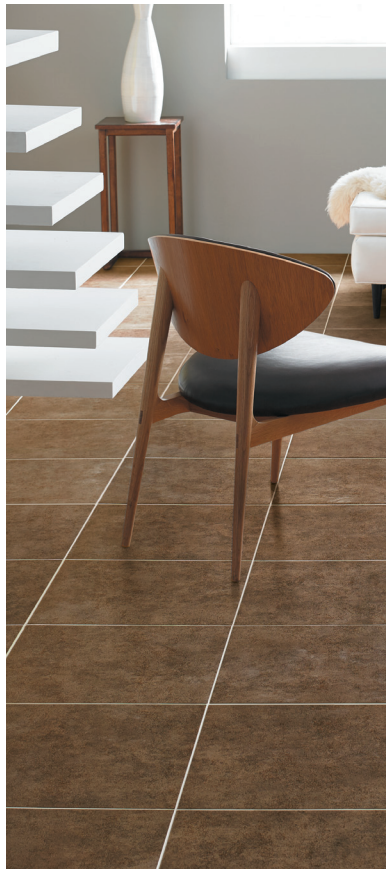
AV115 ▶ Rushmore 18x18