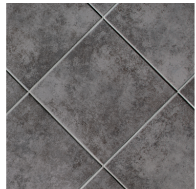
AV116 ▶ Plymouth Rock