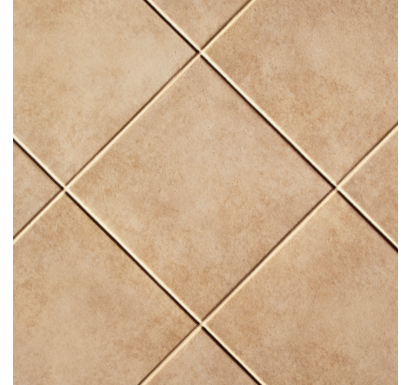
AV112 ▶ Gold Rush