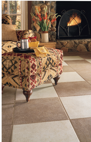
AV111 ▶ Monticello 18x 18 and AV114 ▶ Grand Canyon 12x 12, 18x 18

Regular cleaning is the best way to keep EcoCycle Americana® tile looking good for years to come. Use clean, hot water (combined with a household cleaner for more aggressive cleaning). Rinse thoroughly and dry with a soft cloth. No waxes are needed. More information regarding the care and maintenance of Crossville® products is available at CrossvilleInc.com.