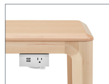
POWER MODULE OPTION