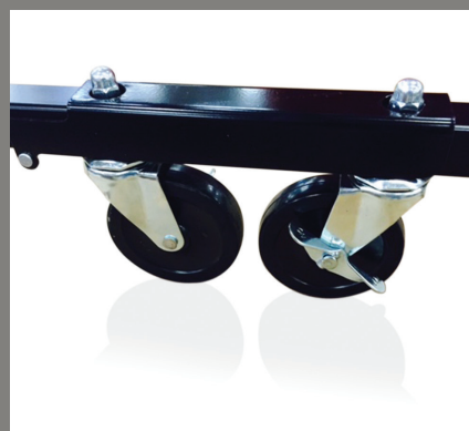
Hinged sliding ganger allows tables to be moved while ganged.