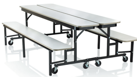
Gang two benches together to create table for lunch time or group projects