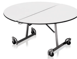
OVAL - Sizes - 60"x66" or 60"x72" - Heights - 27", 29", or WA 31.5"