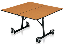
SQUARE - Size - 48" - Heights - 27", 29", or WA 31.5"