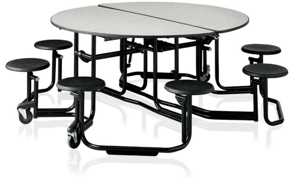
WITH STOOLS - Sizes - 60" table diameter only (81" total diameter with 8 stools) - Stools - textured polypropylene or thermoset hard plastic - Heights - 27" or 29"