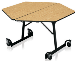
HEXAGONAL - Size - 48" - Heights - 27", 29", or WA 31.5"