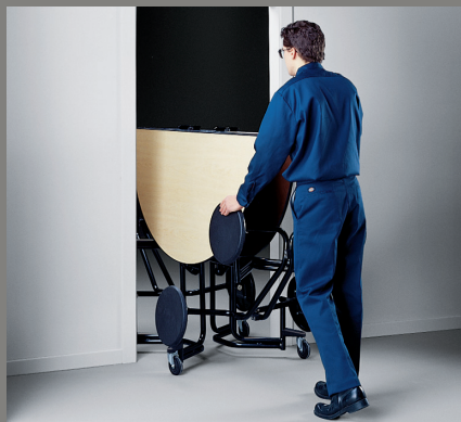
With ample doorway clearance, tables can be safely moved in the closed and locked position through standard door openings.