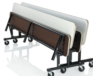
Nest folded benches for easy storage