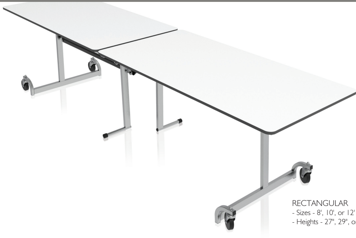
RECTANGULAR - Sizes - 8', 10', or 12' - Heights - 27", 29", or WA 31.5"