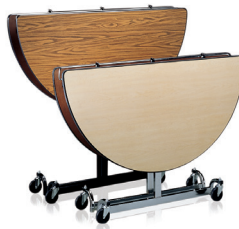
ROUND - Sizes - 48", 60", or 72" diameter - Heights - 27", 29", or WA 31.5"