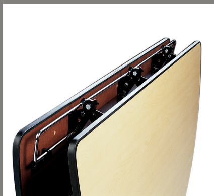
Central hinge design has three hinges for increased strength, stability and table life.