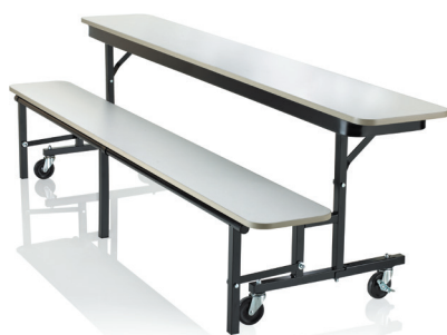
Convert from seat with back (shown above) to seat with worksurface