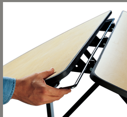
Semi-open safety lock must be purposely released before table can be fully opened.