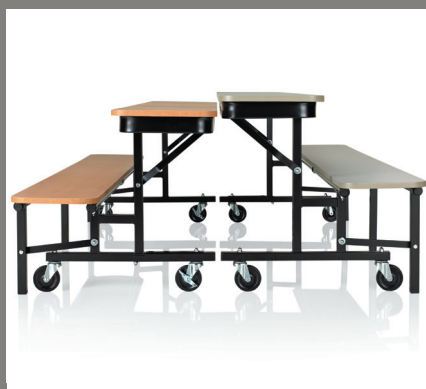
27" or 29" worksurface height