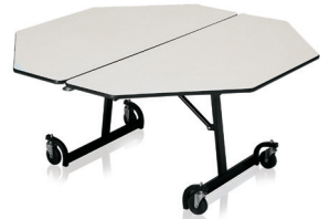
OCTAGONAL - Size - 60" - Heights - 27", 29", or WA 31.5"