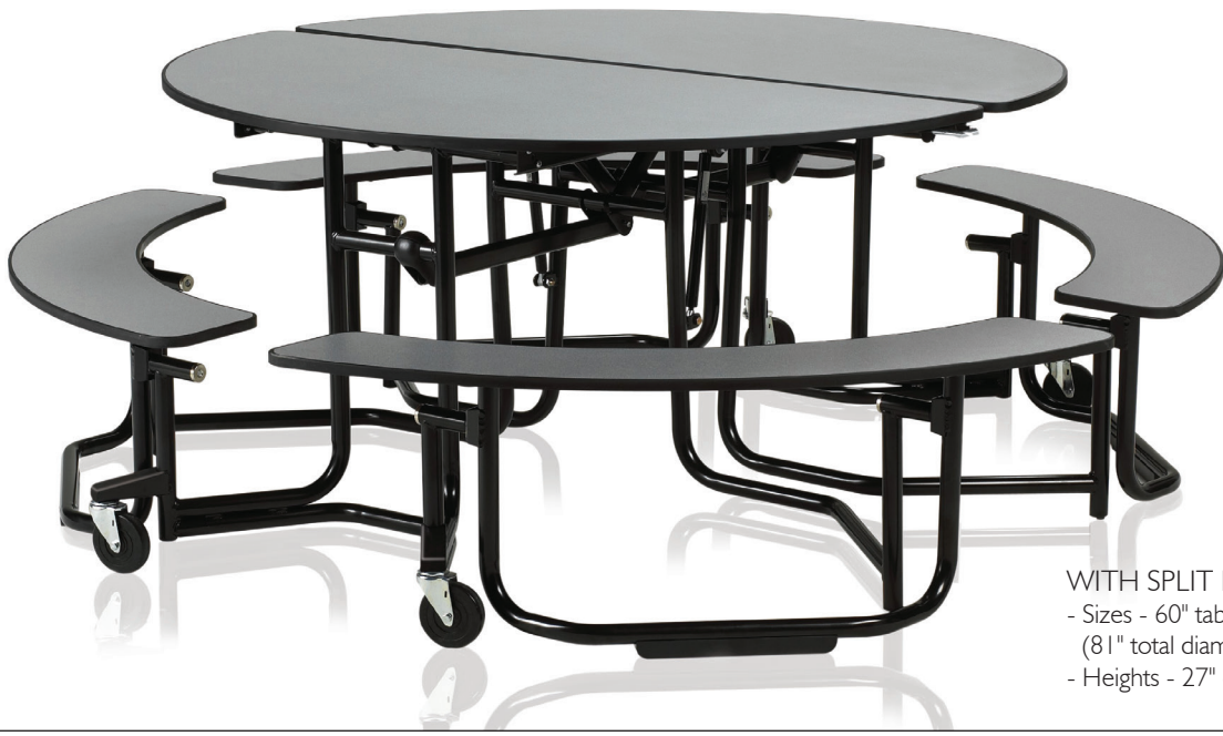
WITH SPLIT BENCHES - Sizes - 60" table diameter only (81" total diameter) - Heights - 27" or 29"