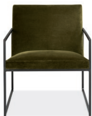
25w 30d 30h chair