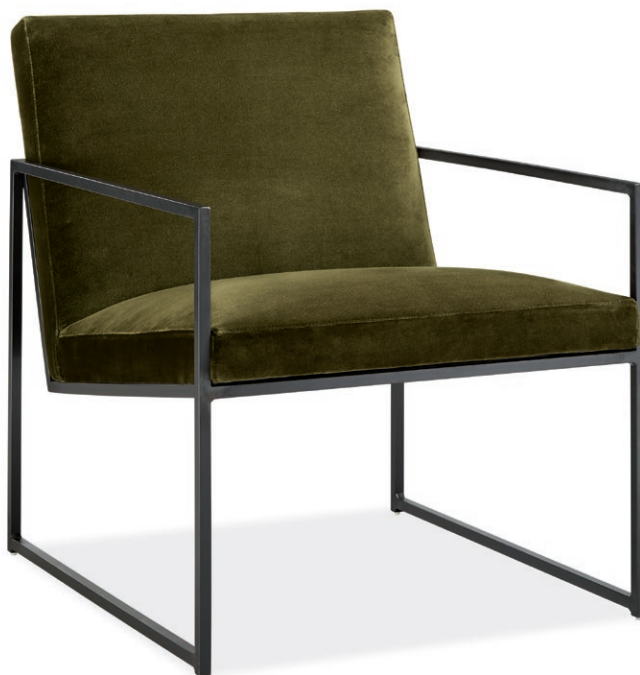
Novato chair in Vance olive