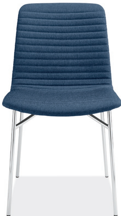
Cato side chair in Medley ink with chrome legs