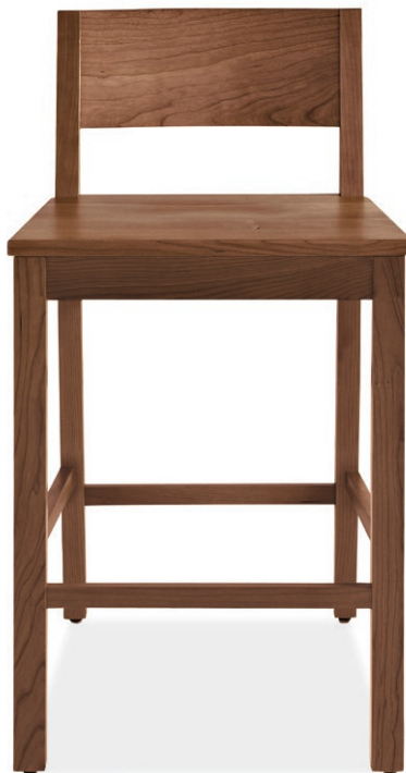
Afton counter stool with wood seat in walnut