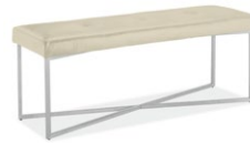
50w 16d 18h bench