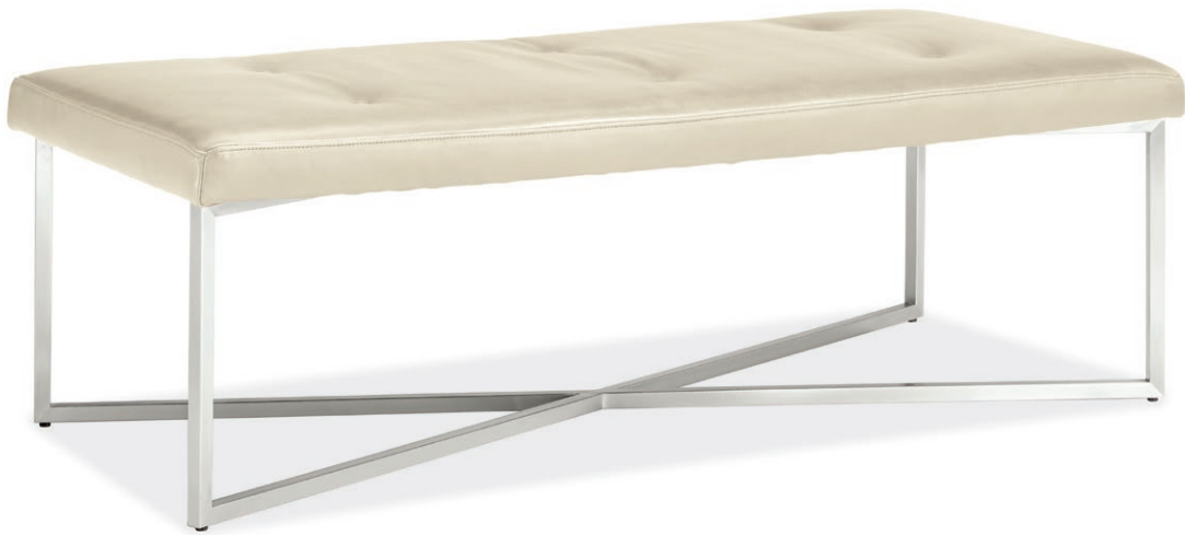
Sidney 50w 22d 16h ottoman in Urbino ivory with stainless steel base