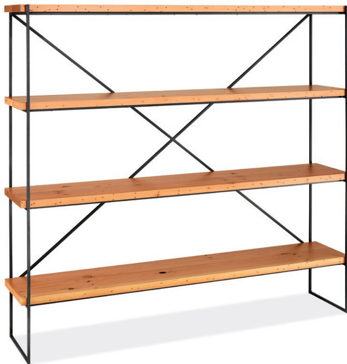
Etting 72w 15d 66h reclaimed wood bookcase