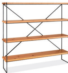
72w 15d 66h bookcase