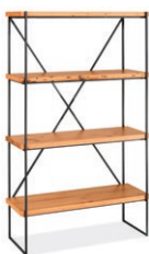
40w 15d 66h bookcase