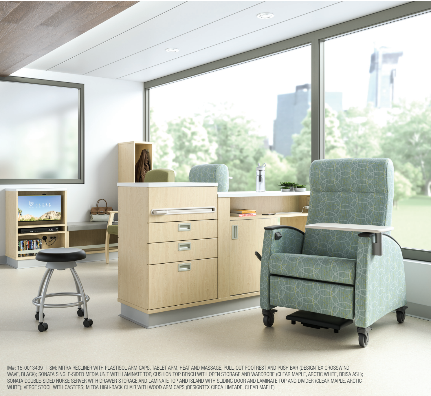
IM#: 15-0013439 | SM: MITRA RECLINER WITH PLASTISOL ARM CAPS, TABLET ARM, HEAT AND MASSAGE, PULL-OUT FOOTREST AND PUSH BAR (DESIGNTEX CROSSWIND WAVE, BLACK); SONATA SINGLE-SIDED MEDIA UNIT WITH LAMINATE TOP, CUSHION TOP BENCH WITH OPEN STORAGE AND WARDROBE (CLEAR MAPLE, ARCTIC WHITE, BRISA ASH); SONATA DOUBLE-SIDED NURSE SERVER WITH DRAWER STORAGE AND LAMINATE TOP AND ISLAND WITH SLIDING DOOR AND LAMINATE TOP AND DIVIDER (CLEAR MAPLE, ARCTIC WHITE); VERGE STOOL WITH CASTERS; MITRA HIGH-BACK CHAIR WITH WOOD ARM CAPS (DESIGNTEX CIRCA LIMEADE, CLEAR MAPLE)