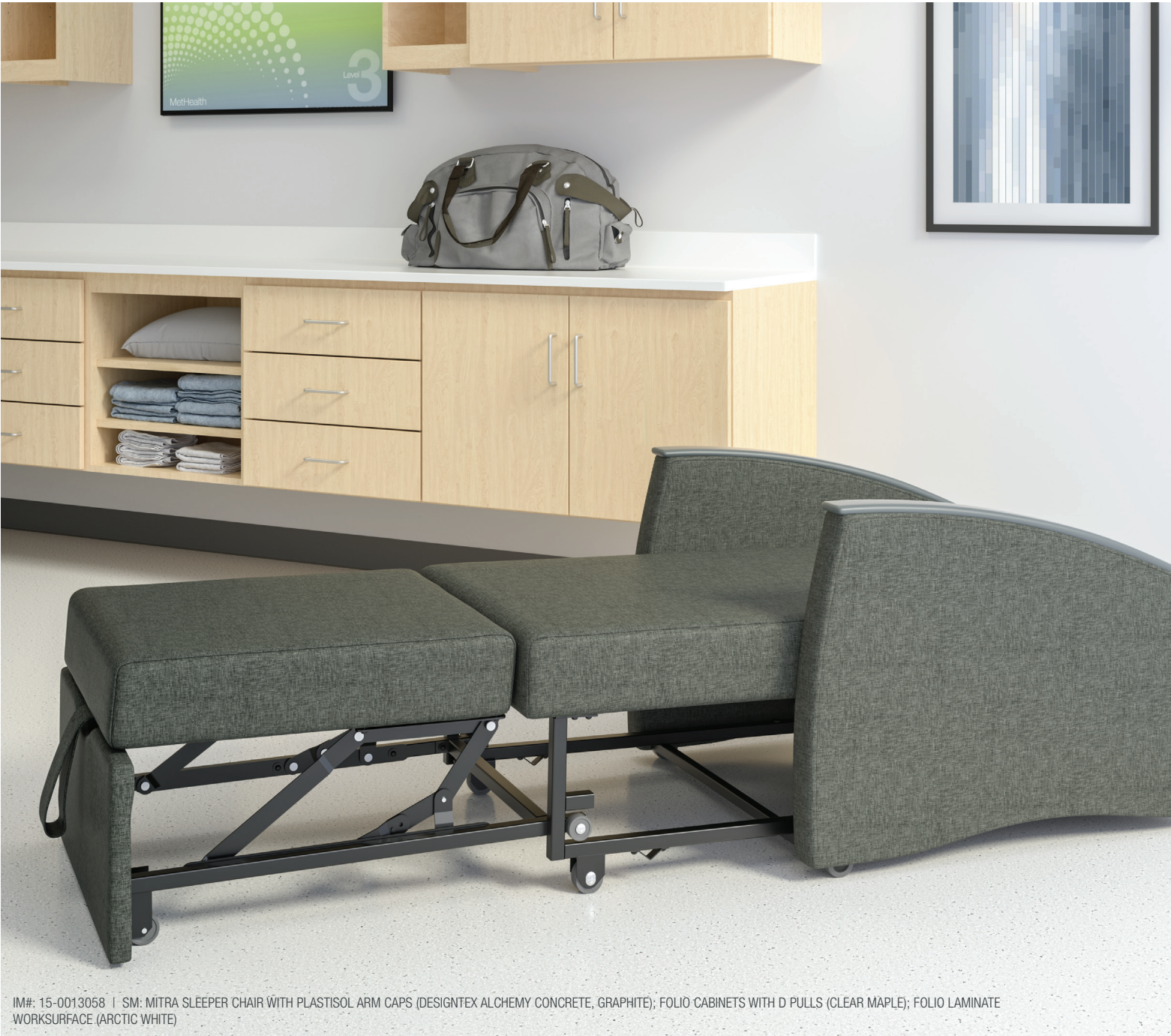
IM#: 15-0013058 | SM: MITRA SLEEPER CHAIR WITH PLASTISOL ARM CAPS (DESIGNTEX ALCHEMY CONCRETE, GRAPHITE); FOLIO CABINETS WITH D PULLS (CLEAR MAPLE); FOLIO LAMINATE WORKSURFACE (ARCTIC WHITE)