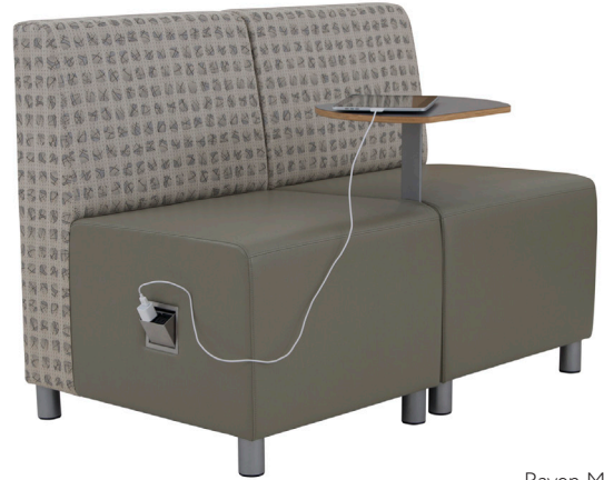
Raven Modular 2 ea. Model 8302 w/Optional Tablet Arm & Power

ERG designs our products so that they can be easily disassembled and separated for recycling or reuse at the end of a products useful life.