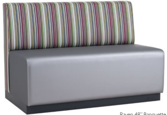
Raven 48'' Banquette Model 8372

End of Life: Recycling & Reuse ERG designs our products so that they can be easily disassembled and separated for recycling or reuse at the end of a products useful life.