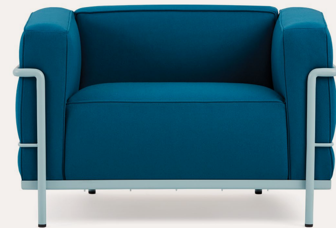
LC3 by Cassina Designed by Le Corbusier, Jeanneret, Perriand

Engage people with brands that enrich, delight, captivate, and inspire.