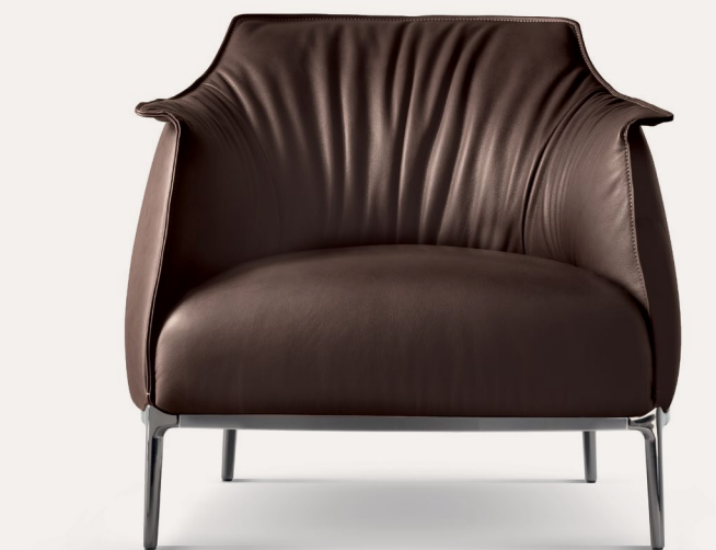
Archibald™ by Poltrona Frau Designed by Jean-Marie Massaud