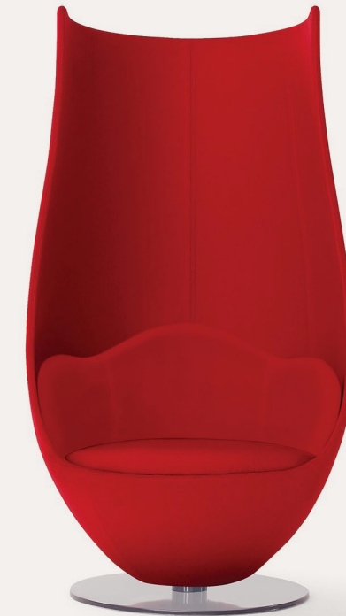
Wanders' Tulip® by Cappellini Designed by Marcel Wanders

Set the tone with high-impression spaces that convey your culture and values.