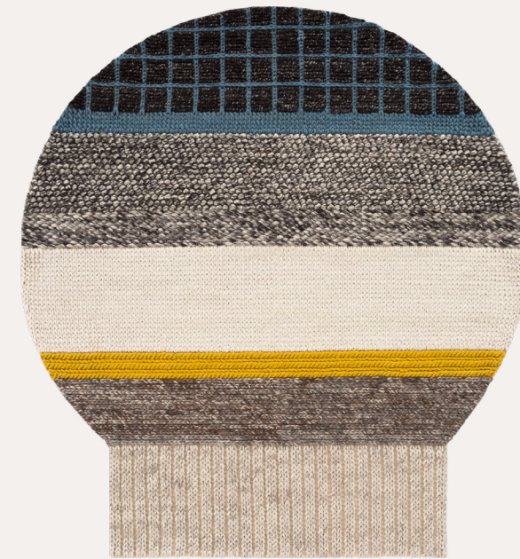
Mangas Original by GAN Designed by Patricia Urquiola

From high-performance to high-impression spaces, Haworth and Haworth Collection support connection.