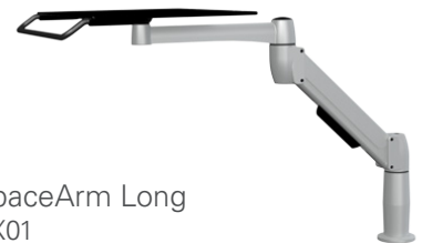
SpaceArm Long SX01