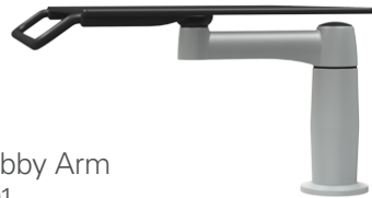
Stubby Arm ST01