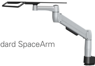
Standard SpaceArm SA01