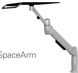
Sit Stand SpaceArm SS01