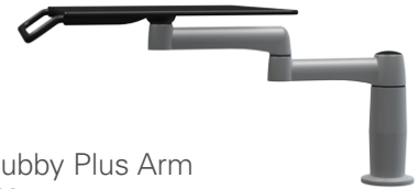
Stubby Plus Arm SP01