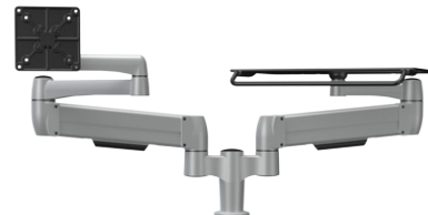
SpaceArm Extended Double Hub SA012XP