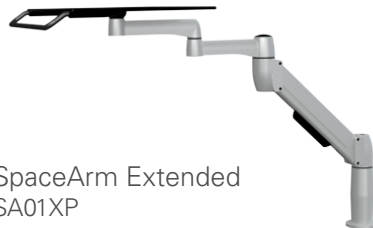
SpaceArm Extended SA01XP