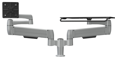
SpaceArm Extended Double Hub SA012XP