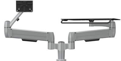
Sit Stand SpaceArm Double Hub SS012