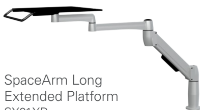
SpaceArm Long Extended Platform SX01XP