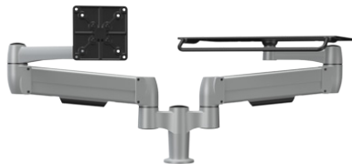
SpaceArm Long Double Hub SX012