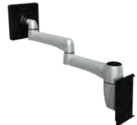
Vertical Mount Stubby SP01VM