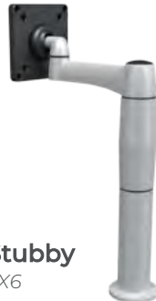
6" Stubby ST01X6