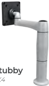
4" Stubby ST01X4

SpaceArm Stubby is essentially just like our Monitor Arm—but made even more compact for those with limited space. With this product, effortlessly shift your monitor from right to left, or from portrait to landscape.