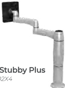
4" Stubby Plus SP02X4