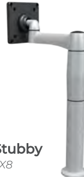
8" Stubby ST01X8