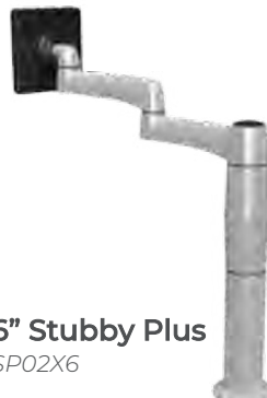
6" Stubby Plus SP02X6