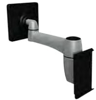
Vertical Mount Stubby ST01VM