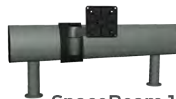
SpaceBeam 1 Mount ST01BM - Stubby SP01BM - Stubby Plus