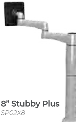
8" Stubby Plus SP02X8