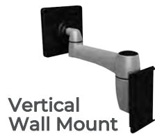
Vertical Wall Mount ST01VM - Stubby SP01VM - Stubby Plus