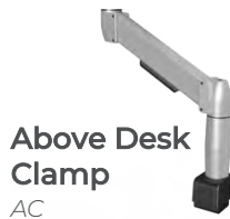
Above Desk Clamp AC