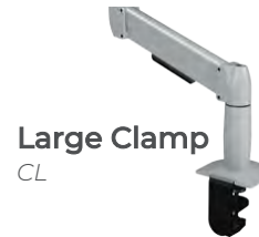
Large Clamp CL