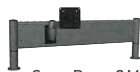
SpaceBeam 2 Mount ST01VM - Stubby SP01BM - Stubby Plus

We also carry a number of Vertical Mounts from manufacturers such as Steelcase, Allsteel, Haworth, Teknion, Knoll, Herman Miller, DIRT and others. To learn more, please visit our website.