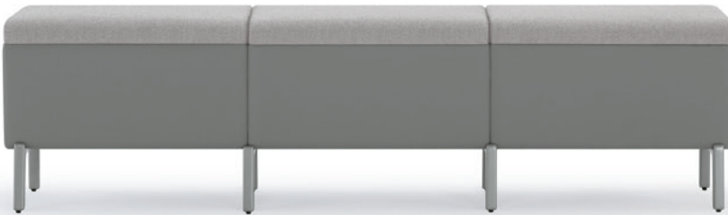
#1724-G Straight Modular Bench #1781 Ganging Legs #1780 End Legs