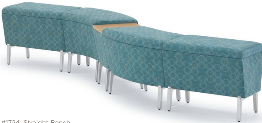
#1724 Straight Bench #1745 45-Degree Bench #1712-W Table, Wood Top

Stand-alone benches and tables allow reconfigurability at a moment's notice, while modular units are equipped with ganging legs to ensure configurations remain securely in place.