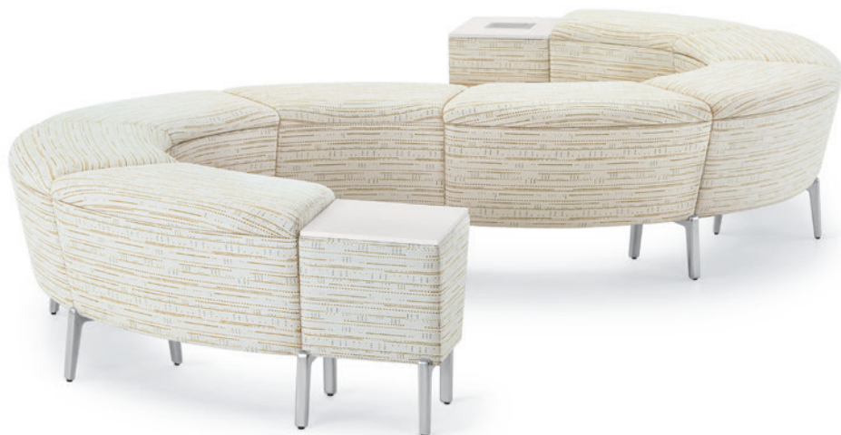
#1712-G-SF Modular Table, Solid Surface Top #1745-G 45-Degree Modular Bench #1712-G-SF-PP3 Modular Table, Solid Surface Top, Portal Power 3 Unit #1781 Ganging Legs #1780 End Legs