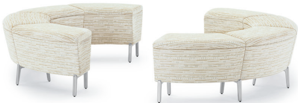
#1745-G 45-Degree Modular Bench #1781 Ganging Legs #1780 End Legs

Benches align together to create configurations of all shapes and sizes. Combine with tables and optional power units to provide even more functionality.