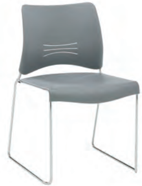
2410-31 Medium Grey