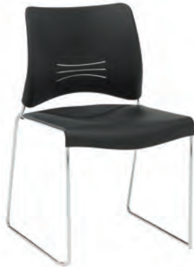
2410-30 Very Black