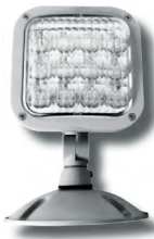
DIMENSIONS: 4-1/4" x 6-5/8"