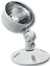
DIMENSIONS: 4-1/2" x 6-7/8"