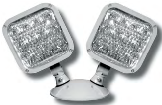
DIMENSIONS: 10-3/8" x 6-3/4"