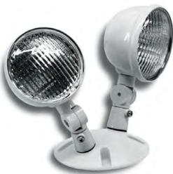
DIMENSIONS: 9-1/4" x 7-1/4"