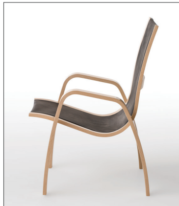
Ingmar with saddle leather