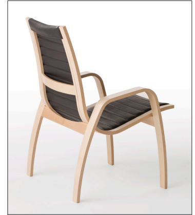
Ingmar upholstered in leather with channel stitching