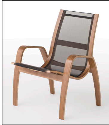
Ingmar with polymer mesh