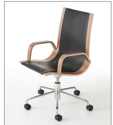
Ingmar with saddle leather, swivel base