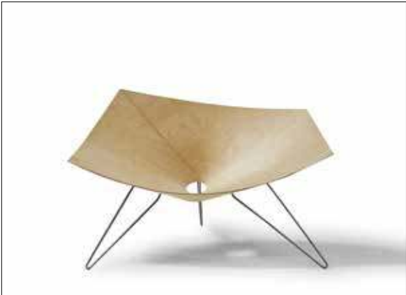
Model # 10286 Patkau Twist