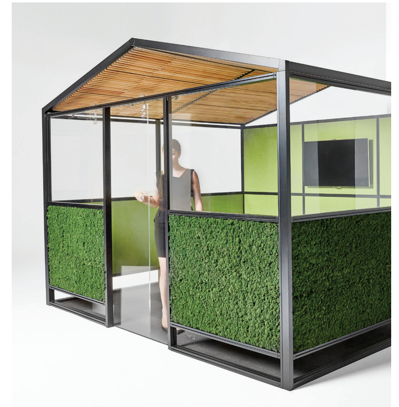
Black powder coat aluminum frame

Constructed of extruded aluminum, Gazebo has been engineered for quick installation with extrusions that allow the structure to be built in less than four hours by two people. The interior ecooustic wall panels and wood ceiling help absorb sound and reduce noise levels, while the well-proportioned structure provides privacy, perfect for today's open office environments.