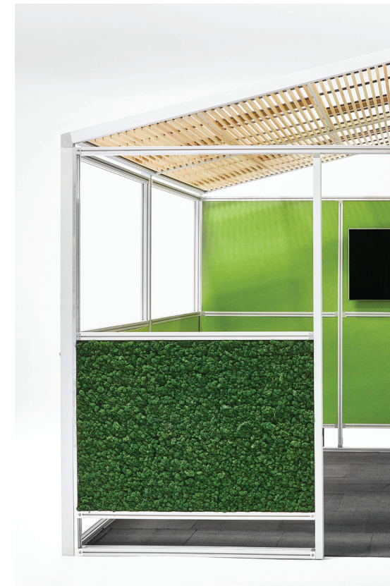
Clear anodized aluminum frame