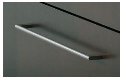
Stainless steel bar pull - Satin finish