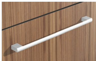
Aluminum bar pull - Silver finish