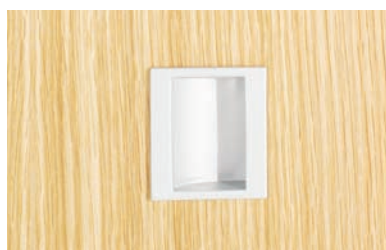
Flush pull - Silver finish

Drawer and Door Pulls: Vox Office drawer and door faces can be personalized with pull options. These include swivel or flush pulls in a range of durable coordinating metallic paint finishes. Aluminum bar pulls are available in a choice of three anodized colors or satin stainless steel. Cabinet cases can be finished with all wood or a combination of wood and metallic or non-metallic paint finishes.