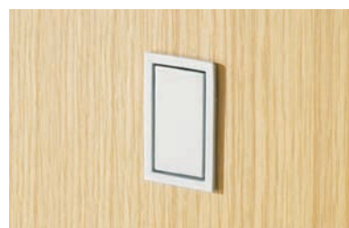
Swivel pull - Silver finish