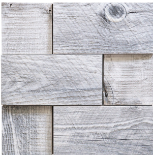
GLACIER DIMENSIONAL SHOWN. ALSO AVAILABLE IN FLAT.