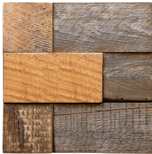
BUCKSKIN DIMENSIONAL SHOWN. ALSO AVAILABLE IN FLAT.