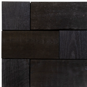
EMBER DIMENSIONAL SHOWN. ALSO AVAILABLE IN FLAT.