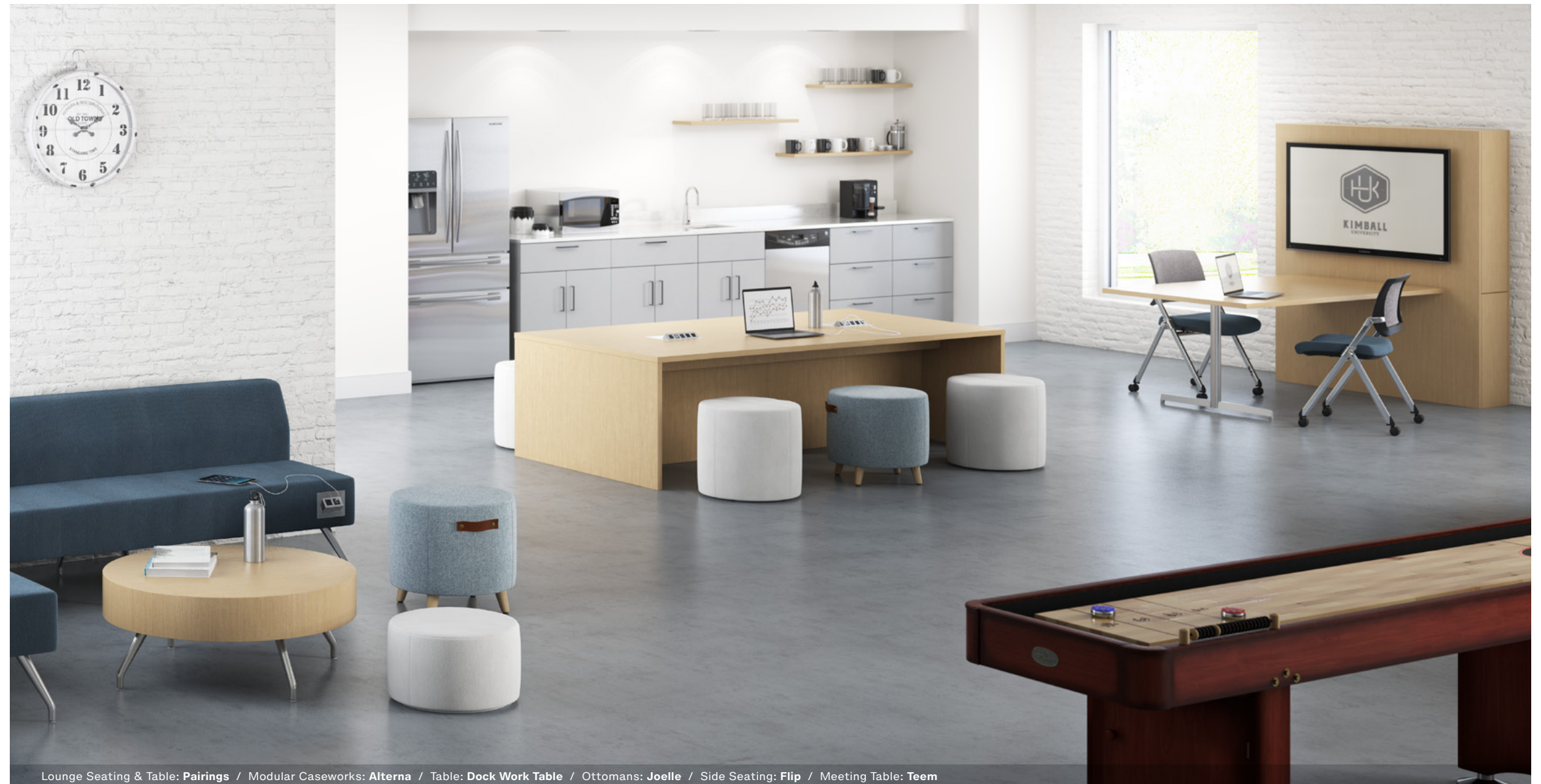
Lounge Seating & Table: Pairings / Modular Caseworks: Alterna / Table: Dock Work Table / Ottomans: Joelle / Side Seating: Flip / Meeting Table: Teem

Inviting spaces that students want to use are important. They provide settings to get work done as well as to relax, refuel and recharge.