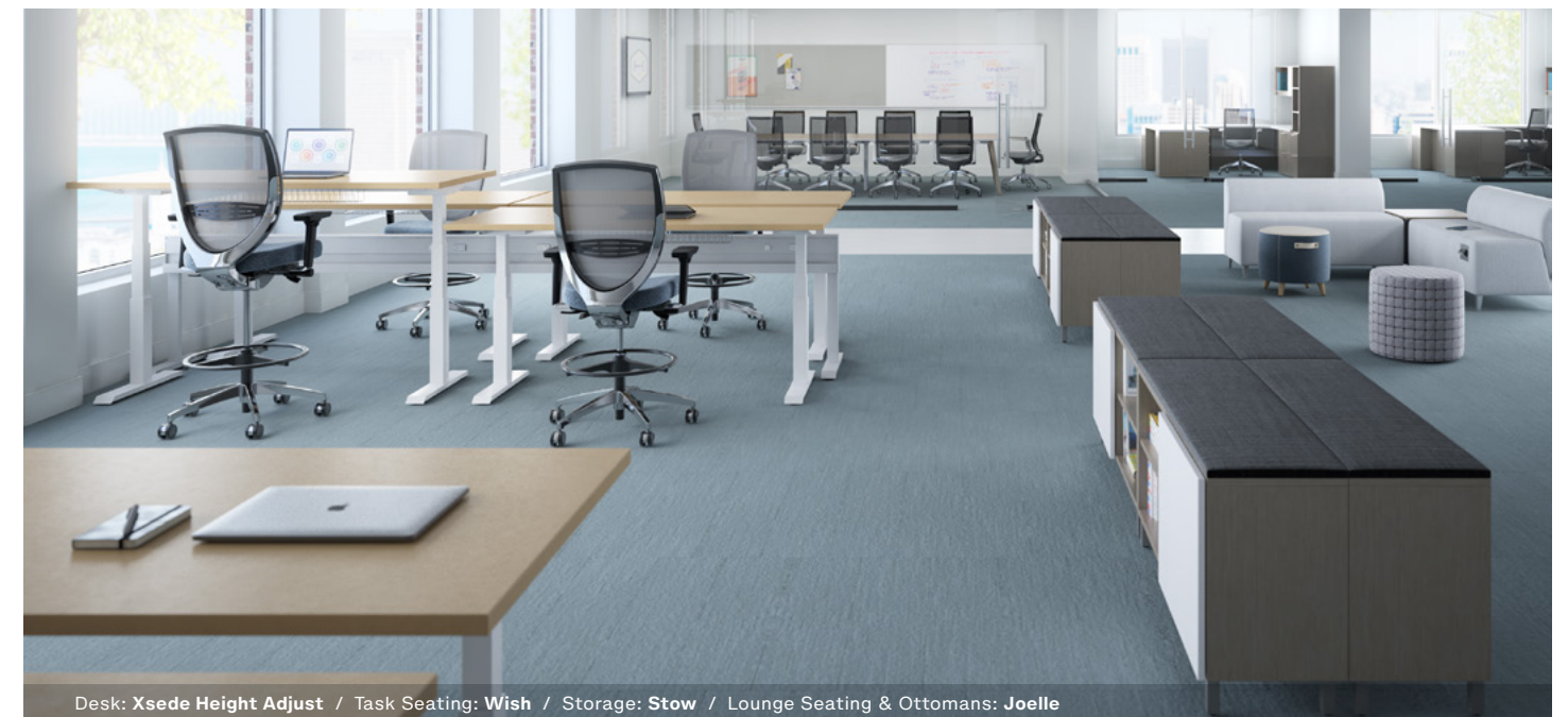
Desk: Xsede Height Adjust / Task Seating: Wish / Storage: Stow / Lounge Seating & Ottomans: Joelle