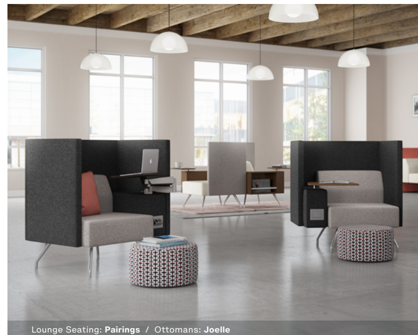
Lounge Seating: Pairings / Ottomans: Joelle