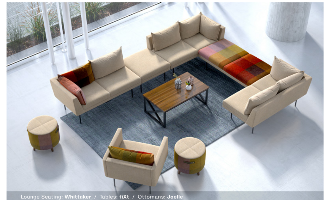
Lounge Seating: Whittaker / Tables: fiXt / Ottomans: Joelle