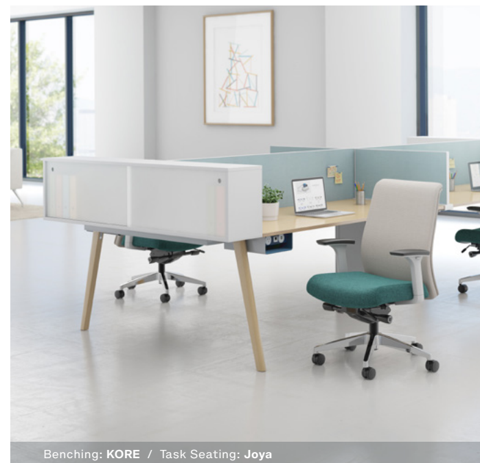
Benching: KORE / Task Seating: Joya