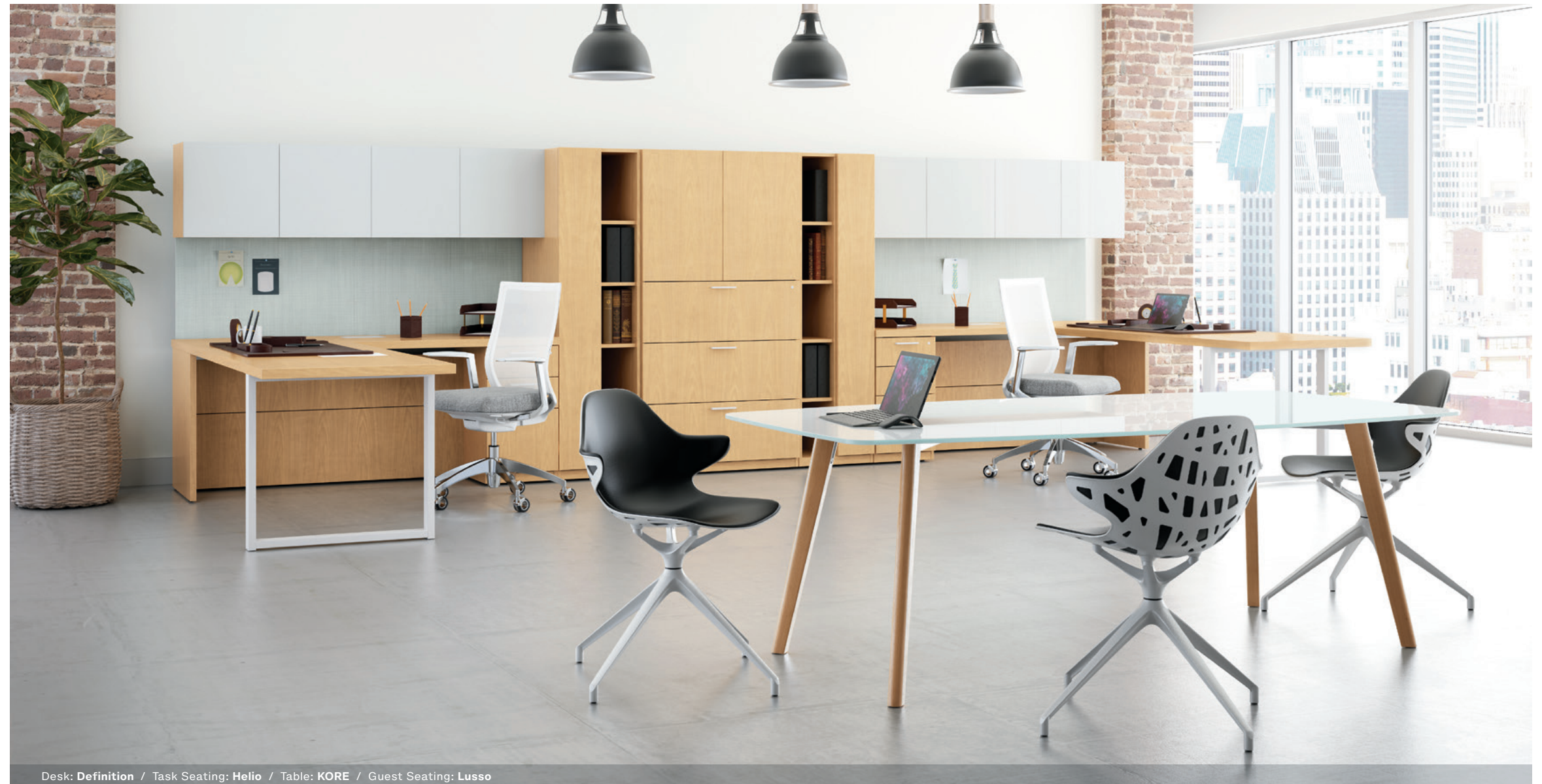
Desk: Definition / Task Seating: Helio / Table: KORE / Guest Seating: Lusso

Administrative areas on campus are now more casual with neutral spaces that allow faculty to socialize and interact, as well as share ideas with each other, instructors and students.