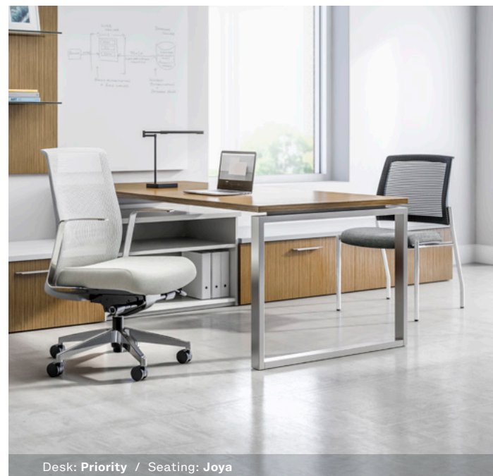
Desk: Priority / Seating: Joya