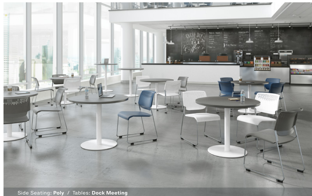
Side Seating: Poly / Tables: Dock Meeting