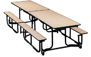
Table frames are fabricated using a welded unitized construction, integrating all structural steel members into a self-supporting unit. The tabletop support apron is 11-gauge channel steel, pierced to securely anchor the tops. End leg and center leg assemblies are robotically wire-welded. Horizontal and vertical tubing are of 1\frac{1}{4} " O.D., 14-gauge steel. Hinges and lock plates are 7-gauge steel. Stretcher bars are \frac{3}{4} " x 1\frac{1}{2} " 14-gauge oval steel tubing. All legs operate from the unitized frame, not the tabletop.