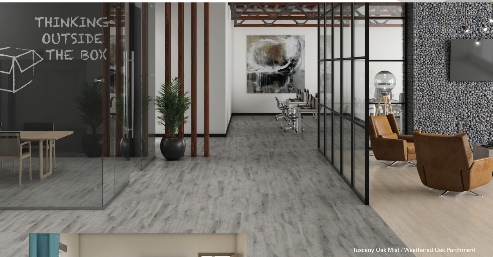
Tuscany Oak Mist / Weathered Oak Parchment