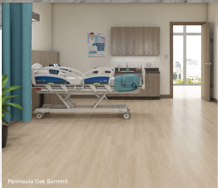
Peninsula Oak Summit

Meticulously designed to look like hardwoods and built to endure heavy traffic, 2DSGN glue down planks offer soft wood grains and contemporary styles with a balanced palette of 22 colors. The highly durable AMP finish makes 2DSGN suitable for high-traffic Retail, Healthcare, Education and Corporate environments, as well as Multi-Family settings.