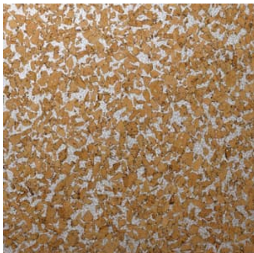
Image depicts 12x12 inch section.