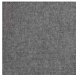
36 middle grey