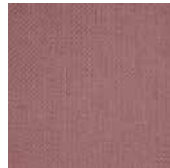
54 light pink