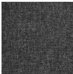
32 dark middle grey