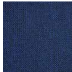
40 dark blue