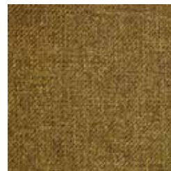
34 dark yellow