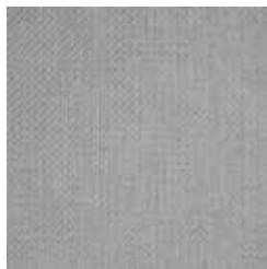
30 light grey