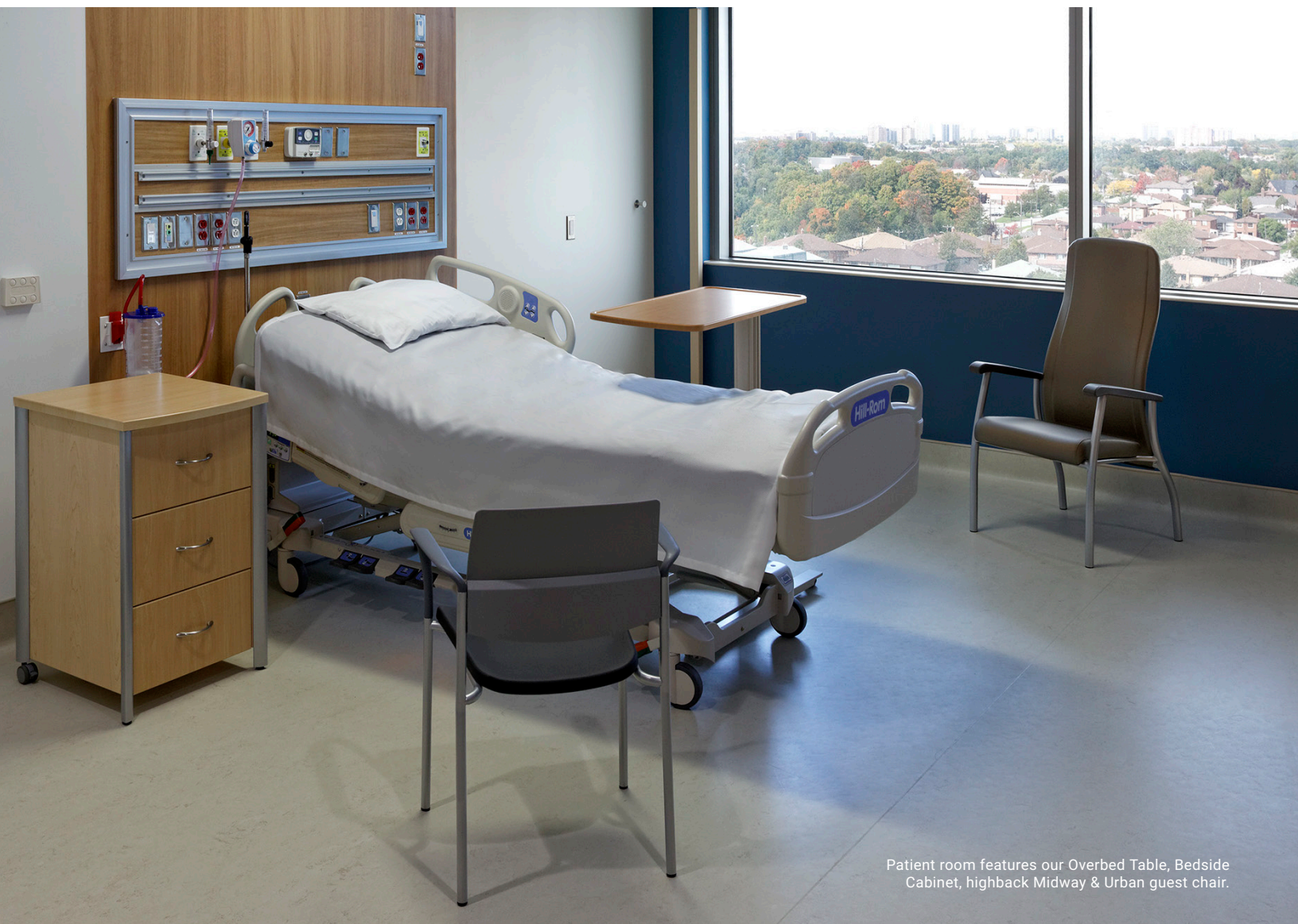
Patient room features our Overbed Table, Bedside Cabinet, highback Midway & Urban guest chair.

One of Canada's largest regional acute care hospitals, the care centre recently opened its doors after having undergone a massive redevelopment program. The brand new hospital, which combined three separate care centers, put technology at the forefront of their modernization efforts and has become North America's first fully digital hospital.