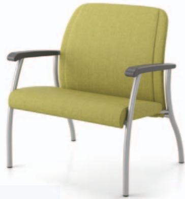
Medium Back Bariatric

Optional Flex Back available on Medium and Highback single-seat chairs.