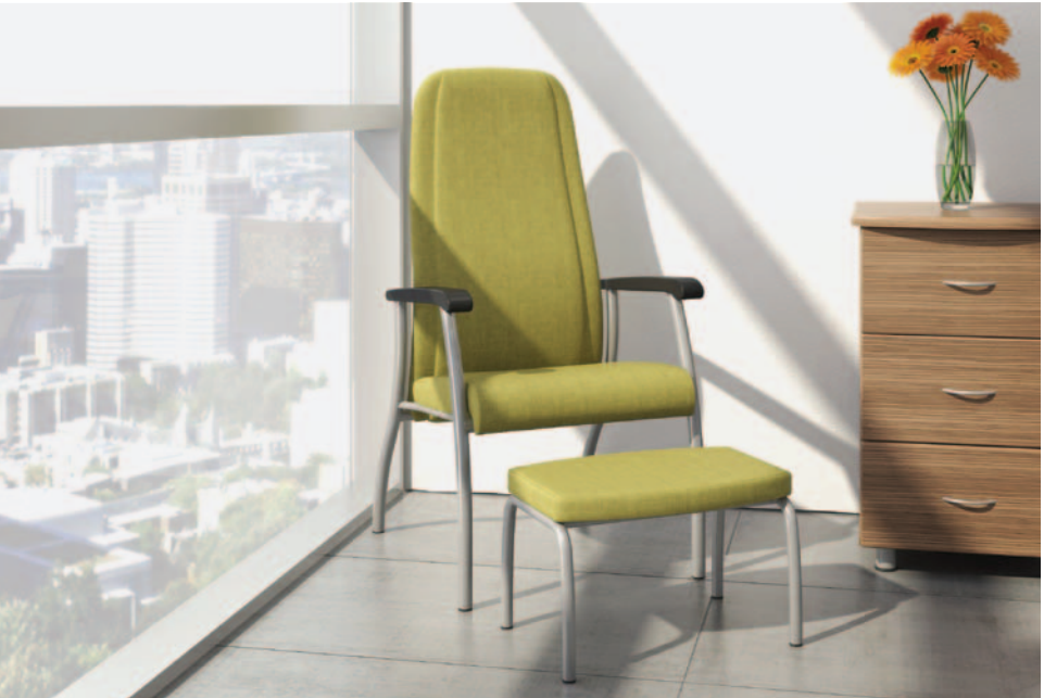
Upholstery: Momentum Beeline, Sprout.