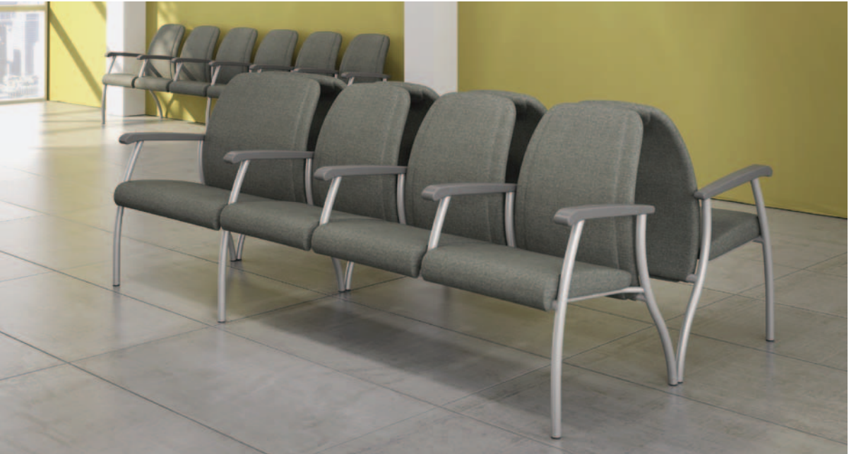
(top) Upholstery: Momentum Beeline, Canvas. (bottom) Upholstery: Momentum Gusto, Shark.

Sit back and relax with Midway, the perfect solution for warm, inviting waiting rooms.