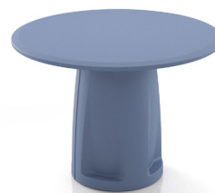
8850-42DIA-ROTO 38 lbs