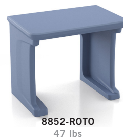
8852-ROTO 47 lbs