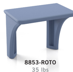
8853-ROTO 35 lbs