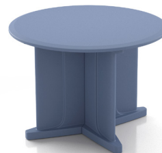
8851-42DIA-ROTO 54 lbs