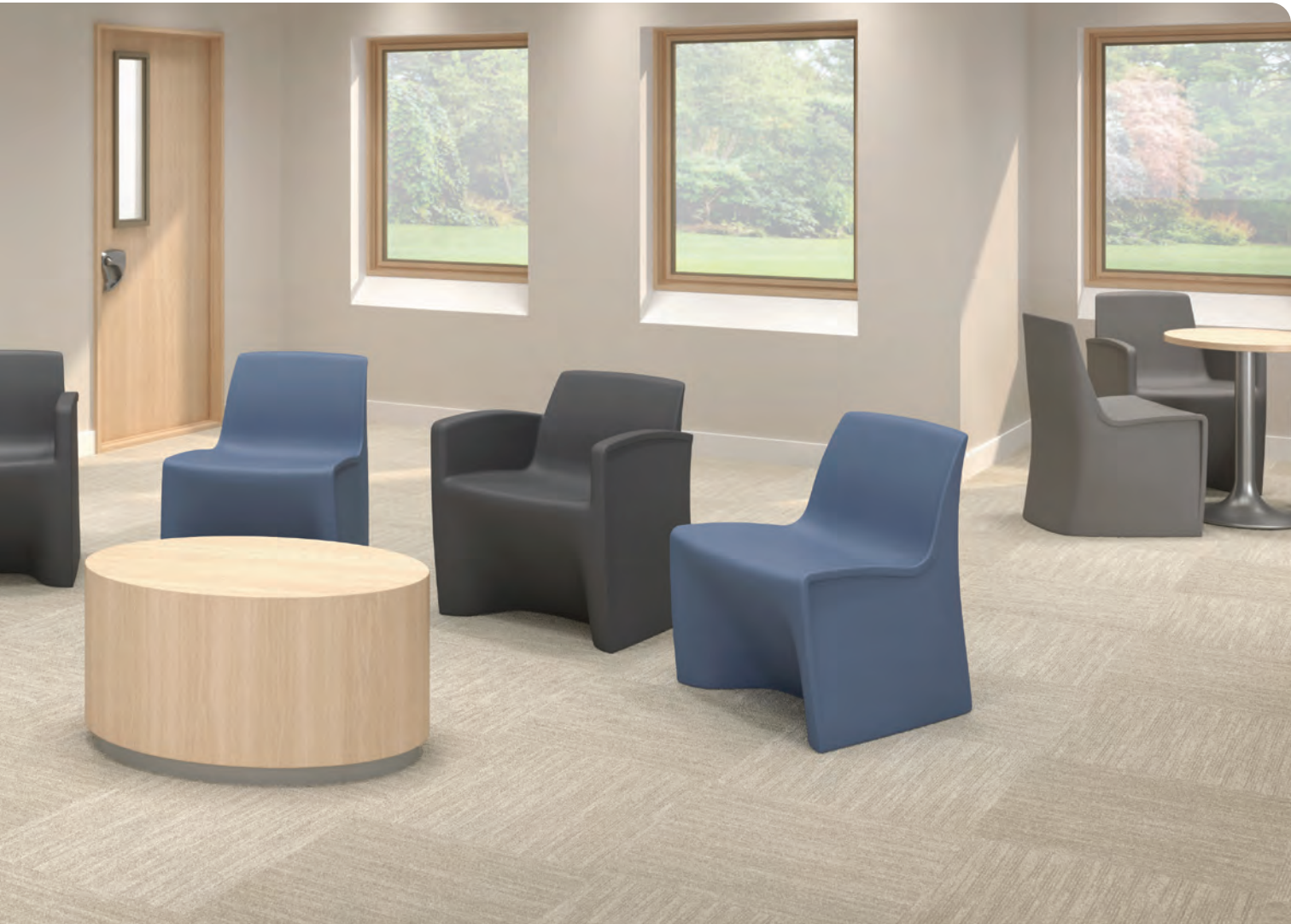
Hardi Lounge Armless Finish: RAL 5014.