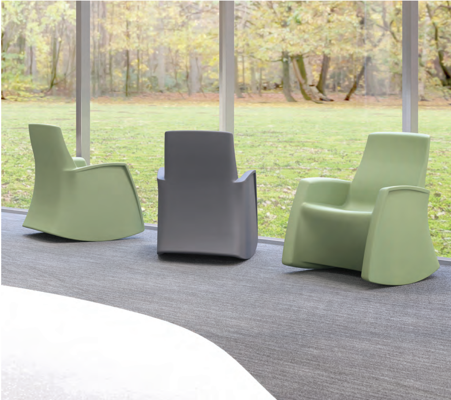
Hardi Rocker Finish: RAL 6021, Green; Finish: RAL 7015, Grey.