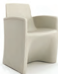
Hardi Dining with Arms