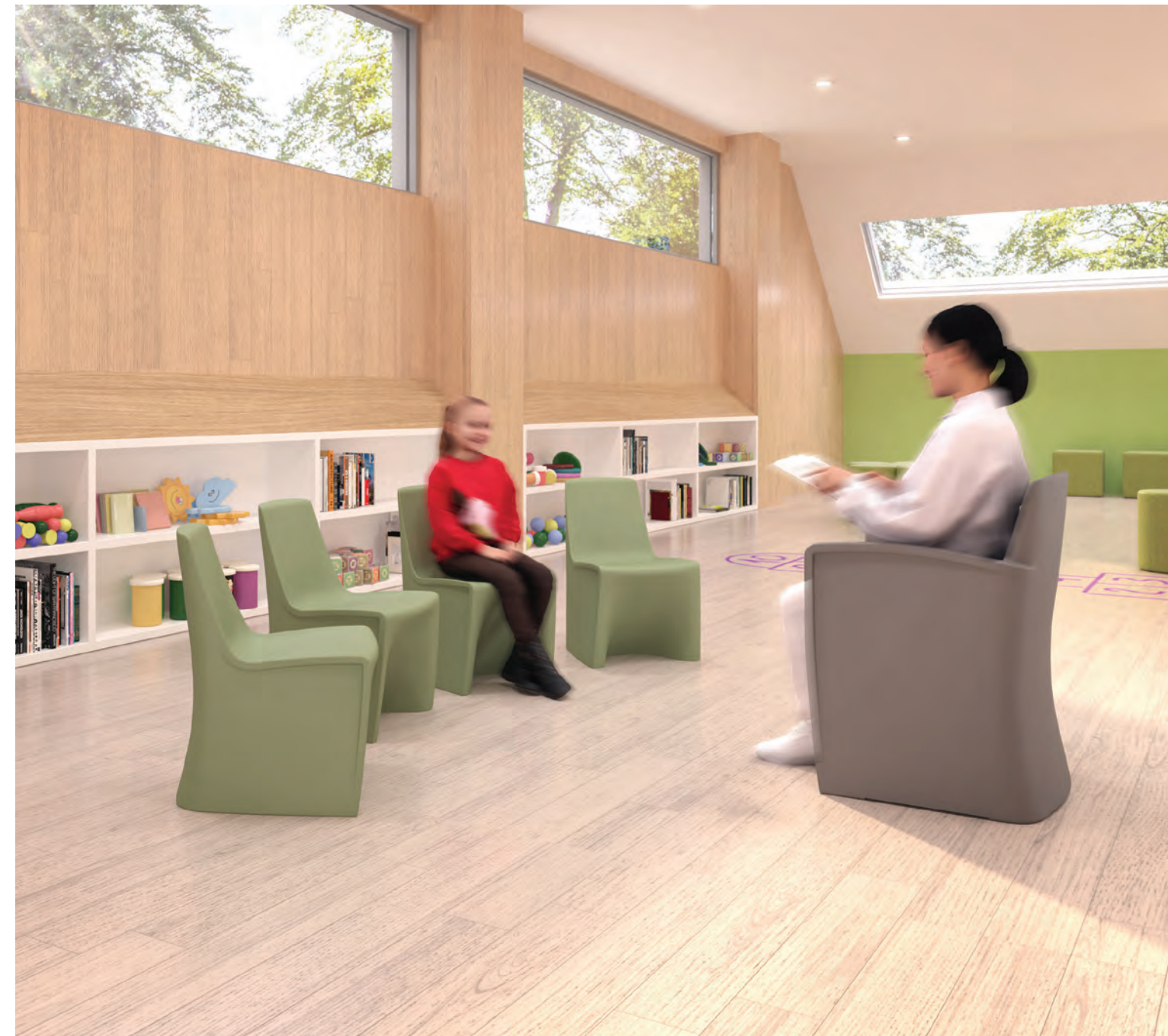
Hardi Children's Finish: RAL 6021.