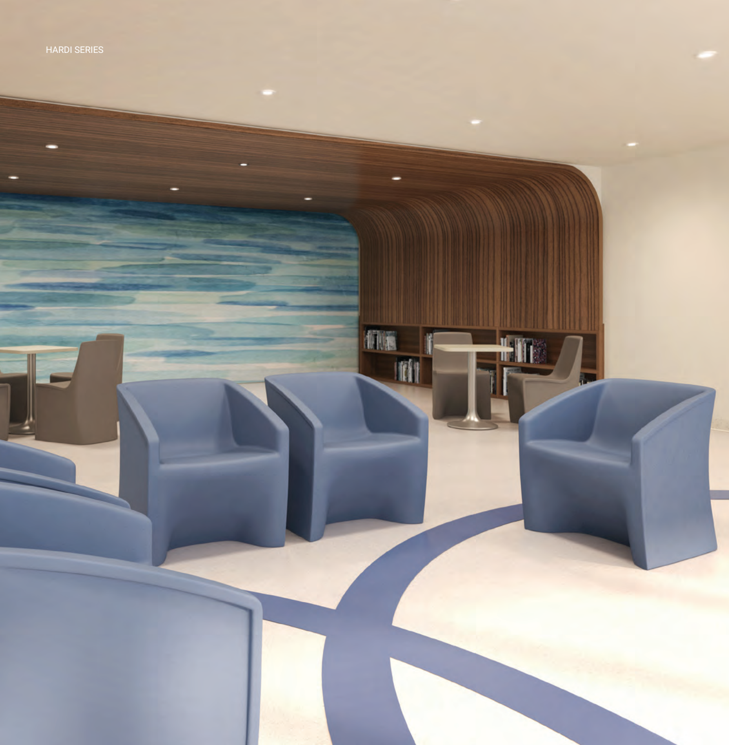
Hardi Dining Armless Finish: RAL 7037.