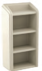
8910, 8911 Endurance Shelves, Wall Mount