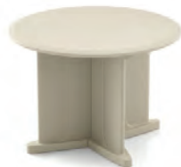
8851 Endurance X-Base Table, Floor Mount