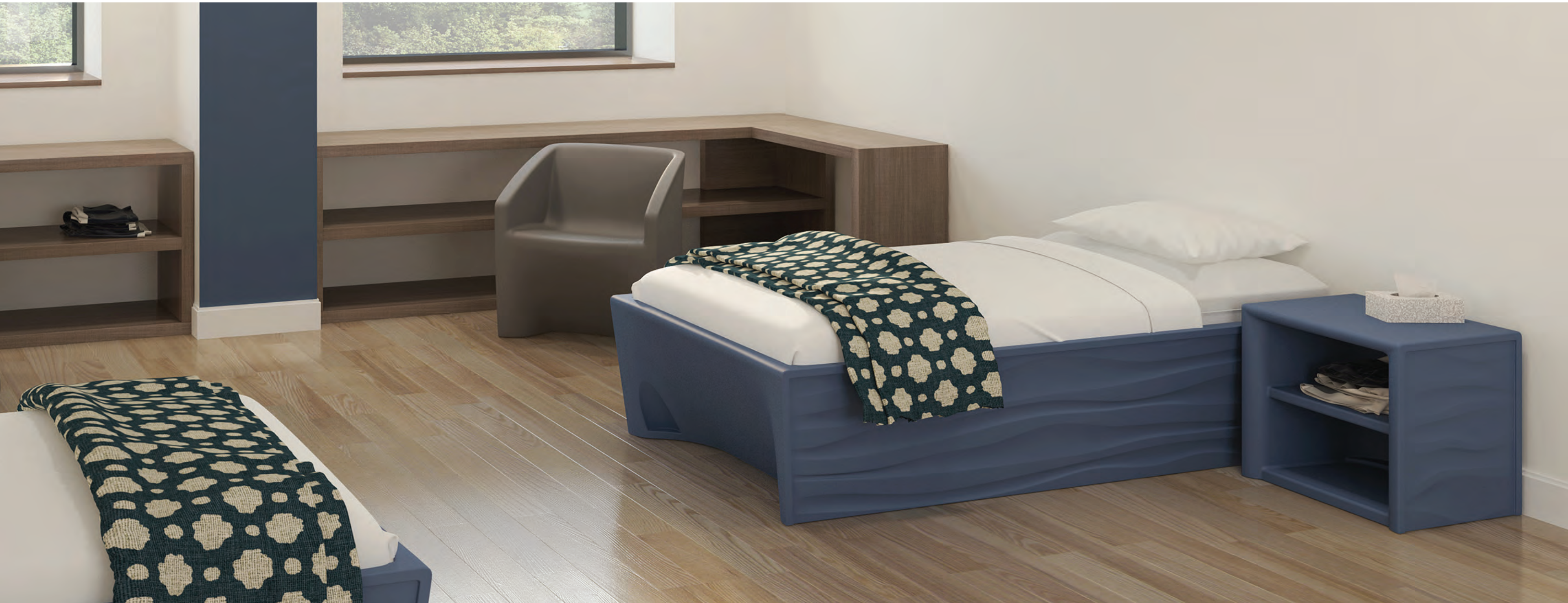
Hardi Bed Finish: RAL 5014. Hardi Bedside Table Finish: RAL 5014. Hardi Club Finish: RAL 7006.