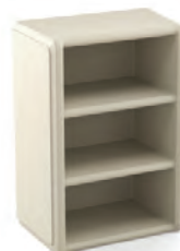
8906 Endurance Open Chest, Floor Mount