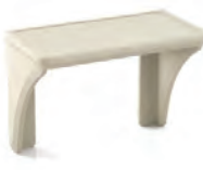
8854 Endurance ADA Desk, Wall Mount