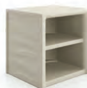
Hardi Bedside Table