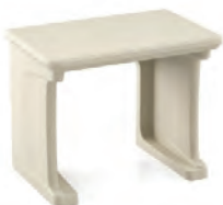
8852 Endurance Desk, Floor Mount