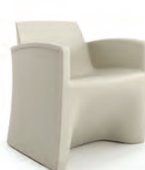
Hardi Lounge with Arms