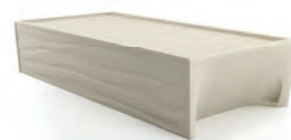
Hardi Patient Bed