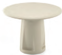
8850 Endurance Cylinder-Base Table, Floor Mount