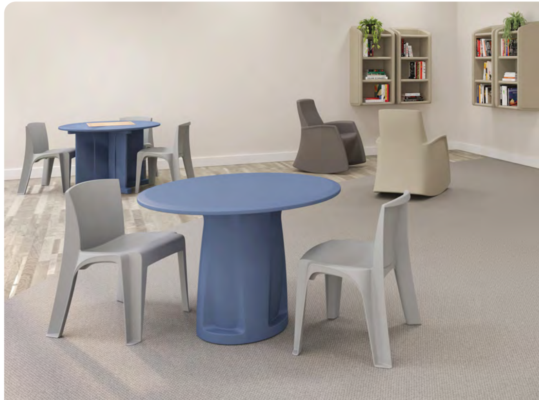
Hardi Stacker Finish: Fog Gray. Hardi Endurance X-Base and Endurance Cylinder Base Tables Finish: RAL 5014. Hardi Rocker Finish: RAL 7037 and RAL 7044. Hardi Endurance 4-Shelf Wall Mount Units Finish: RAL 7044.

From activity spaces, patient rooms, to cafeterias and beyond, Hardi has a solution—all models feature the same durable build.