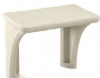
8853 Endurance Desk, Floor & Wall Mount