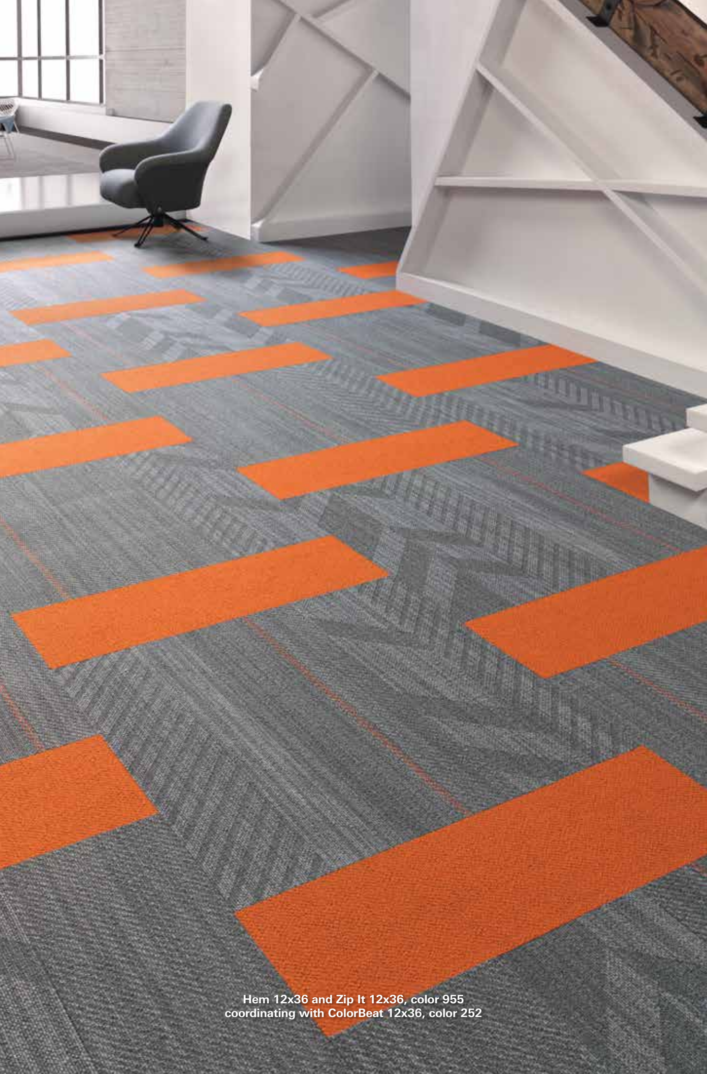
Hem 12x36 and Zip It 12x36, color 955 coordinating with ColorBeat 12x36, color 252