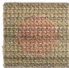
Competitor Solution Dyed / Yarn Dyed Blend