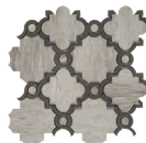
12"x12" Park Avenue Mosaic