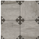
12"x12" Rodeo Drive Mosaic