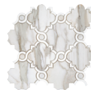
12"x12" Park Avenue Mosaic