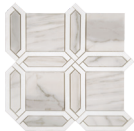
12"x12" Broadway Mosaic