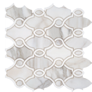
12"x12" Michigan Avenue Mosaic