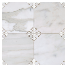
12"x12" Rodeo Drive Mosaic