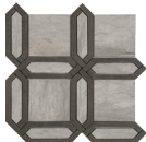
12"x12" Broadway Mosaic