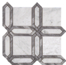
12"x12" Broadway Mosaic