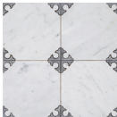
12"x12" Rodeo Drive Mosaic