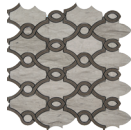
12"x12" Michigan Avenue Mosaic