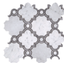
12"x12" Park Avenue Mosaic