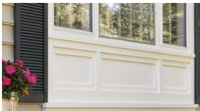
PVC EXTERIOR TRIM & BEADBOARD