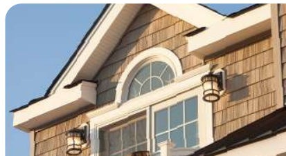
POLYMER SHAKES & SHINGLES

CertainTeed products are designed to work together and complement each other in color and style to give any home a beautiful finished look.