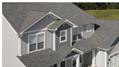
ROOFING AND VENTILATION