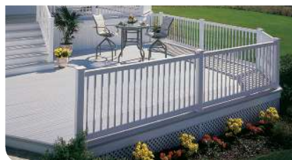
DECKING AND RAILING