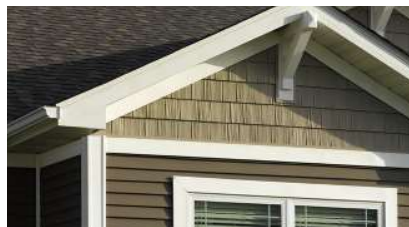
VINYL CARPENTRY® TRIM