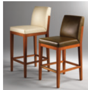
Counter and barstool heights make Alia appropriate for a number of uses