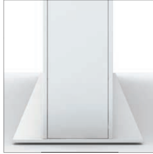
Table Base and Plinth

Preserving the visual simplicity of the Facade tables, an optional privacy screen provides just enough sense of personal space to make a table comfortable to share.