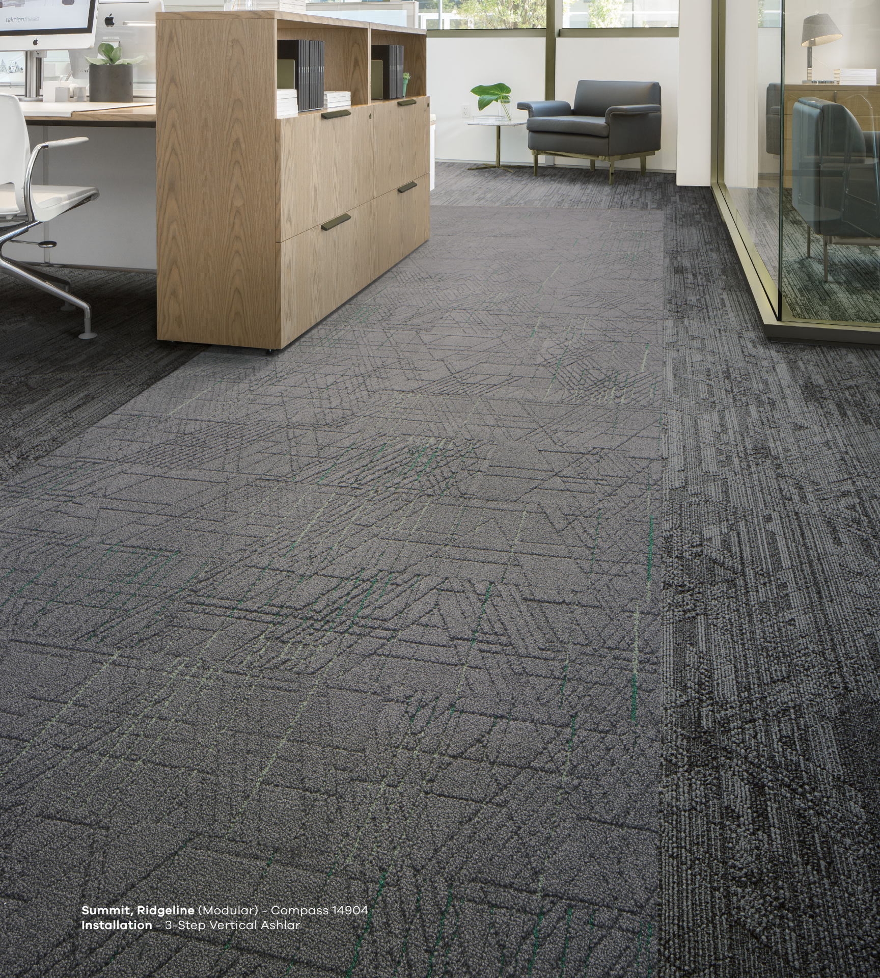
Summit, Ridgeline (Modular) - Compass 14904 Installation - 3-Step Vertical Ashlar