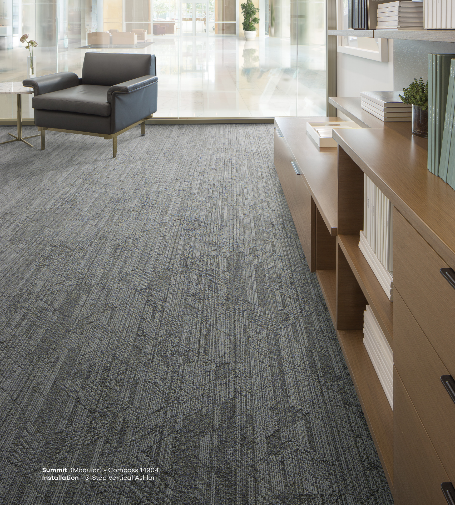
Summit (Modular) - Compass 14904 Installation - 3-Step Vertical Ashlar