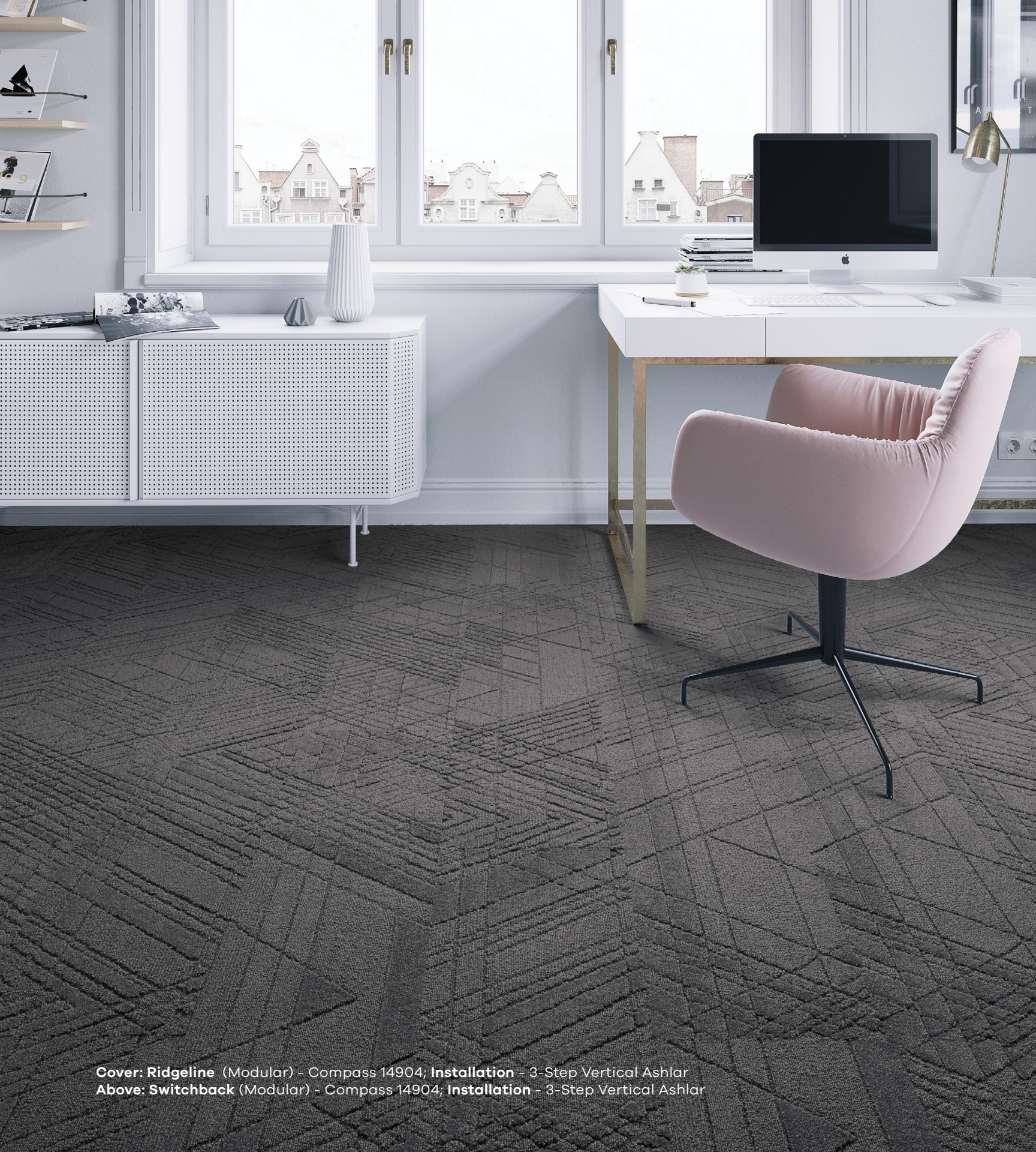
Cover: Ridgeline (Modular) - Compass 14904; Installation - 3-Step Vertical Ashlar Above: Switchback (Modular) - Compass 14904; Installation - 3-Step Vertical Ashlar