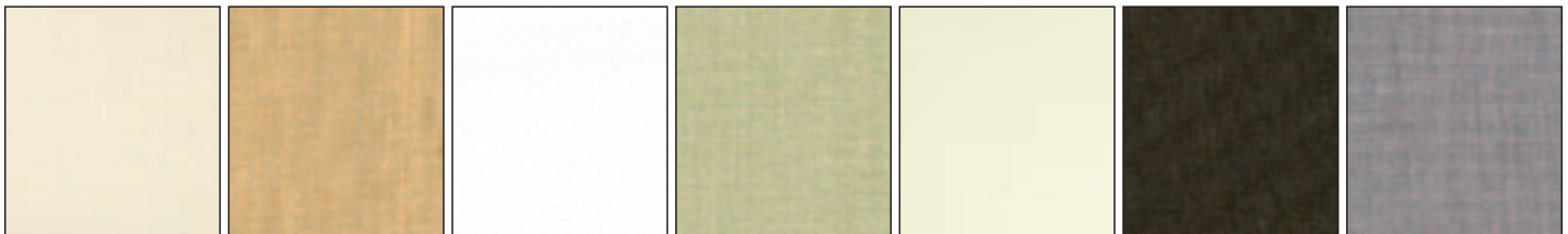
T318 Ivory Silk Pongee