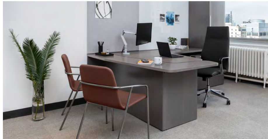
THE EXCLUSIVE SILEA SPLIT-TOP HEIGHT-ADJUSTABLE DESK DELIVERS INTEGRATED POSTURAL ROTATION AND WELCOMING GUEST ACCOMMODATION.