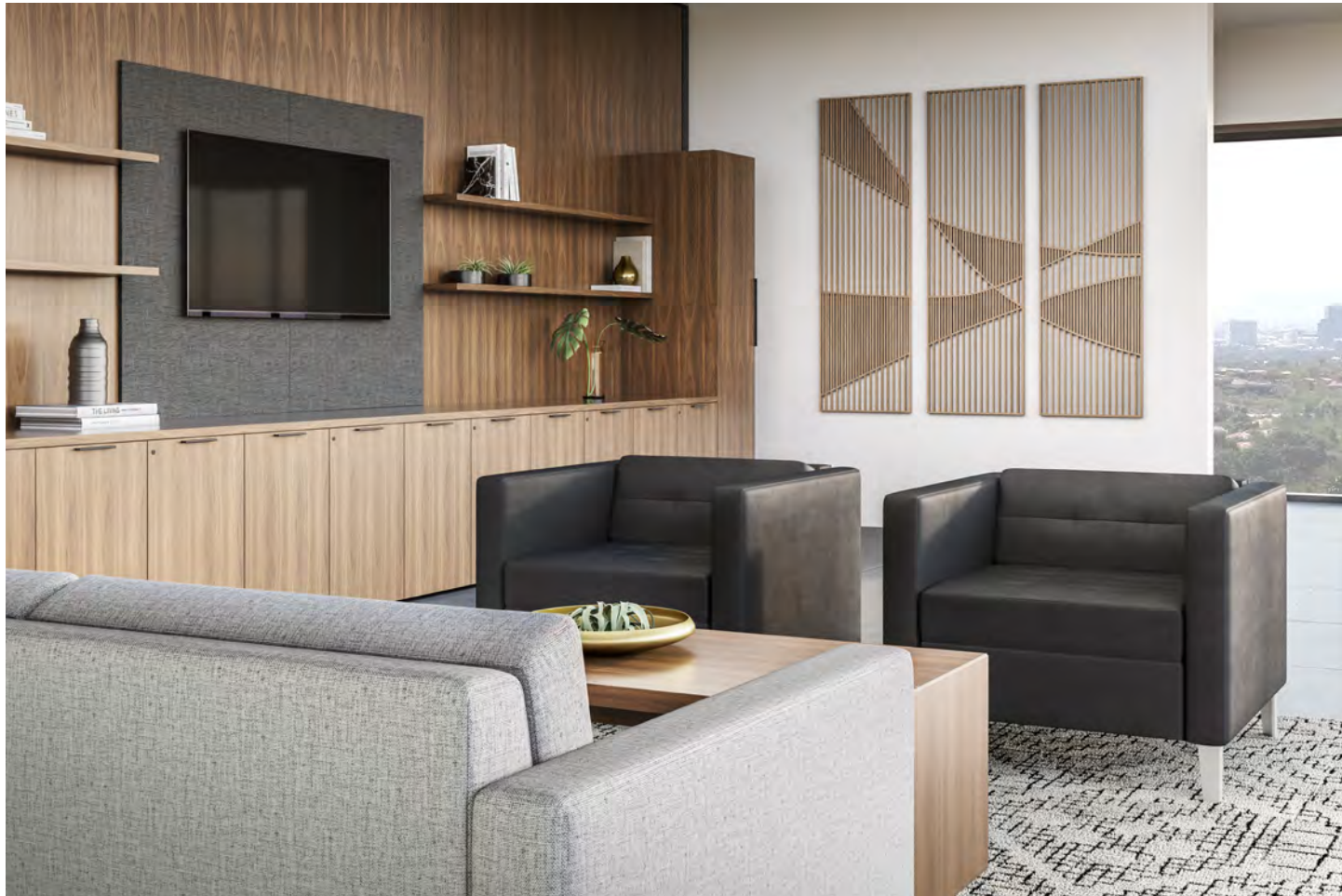
ADJACENT CIJI™ SEATING AND A LETCHWORTH™ TABLE ACCOMPANY A SILEA WALL WITH OPEN AND ENCLOSED STORAGE, UNITING PERFORMANCE AND COMFORT.