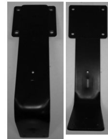
Back Upright - With Welded Plate #IPURBK160S