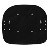
Seat Cover #7-USCKI64