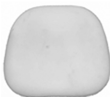
Seat Foam #FMSZA