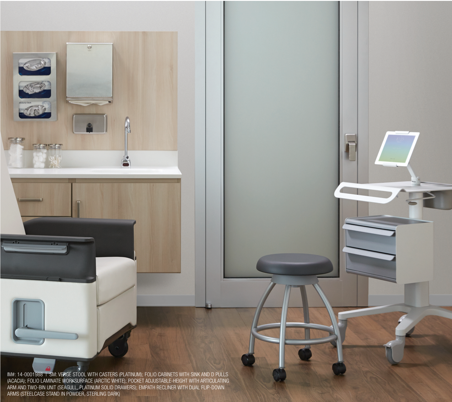
IM#: 14-0001988 | SM: VERGE STOOL WITH CASTERS (PLATINUM); FOLIO CABINETS WITH SINK AND D PULLS (ACACIA); FOLIO LAMINATE WORKSURFACE (ARCTIC WHITE); POCKET ADJUSTABLE-HEIGHT WITH ARTICULATING ARM AND TWO-BIN UNIT (SEAGULL, PLATINUM SOLID DRAWERS); EMPATH RECLINER WITH DUAL FLIP-DOWN ARMS (STEELCASE STAND IN POWDER, STERLING DARK)

Two-way learning is essential for effective healthcare. With eye-to-eye seating, clinicians can easily connect to patients and family members to ensure important information is shared, understood and factored into decisions about care.