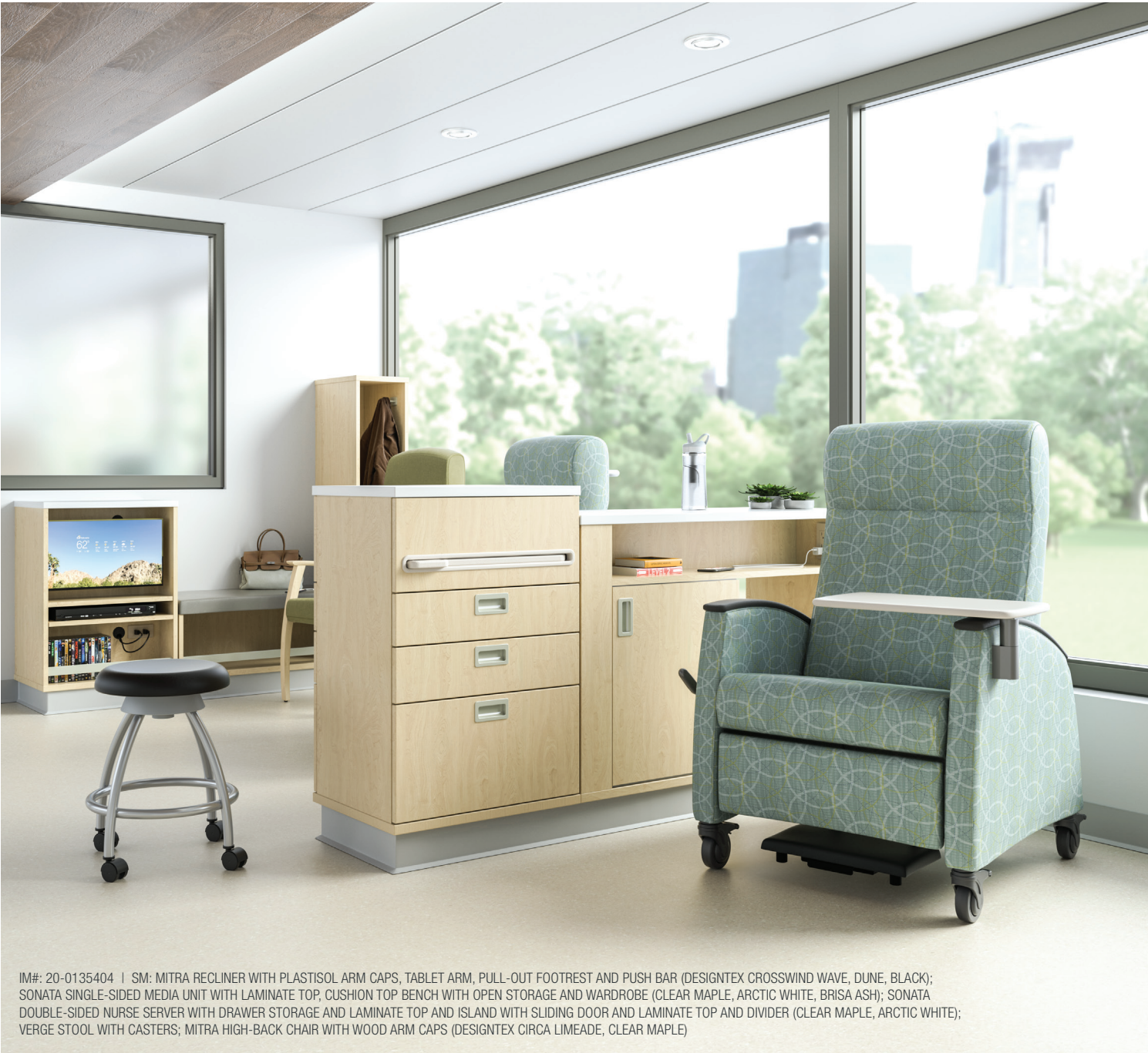
IM#: 20-0135404 | SM: MITRA RECLINER WITH PLASTISOL ARM CAPS, TABLET ARM, PULL-OUT FOOTREST AND PUSH BAR (DESIGNTEX CROSSWIND WAVE, DUNE, BLACK); SONATA SINGLE-SIDED MEDIA UNIT WITH LAMINATE TOP, CUSHION TOP BENCH WITH OPEN STORAGE AND WARDROBE (CLEAR MAPLE, ARCTIC WHITE, BRISA ASH); SONATA DOUBLE-SIDED NURSE SERVER WITH DRAWER STORAGE AND LAMINATE TOP AND ISLAND WITH SLIDING DOOR AND LAMINATE TOP AND DIVIDER (CLEAR MAPLE, ARCTIC WHITE); VERGE STOOL WITH CASTERS; MITRA HIGH-BACK CHAIR WITH WOOD ARM CAPS (DESIGNTEX CIRCA LIMEADE, CLEAR MAPLE)